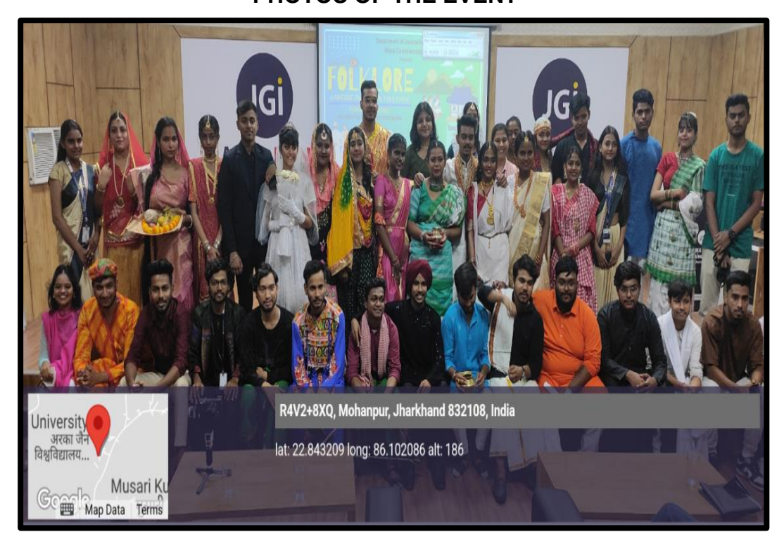
Figure 6: Whole Team of students (participants) for the event