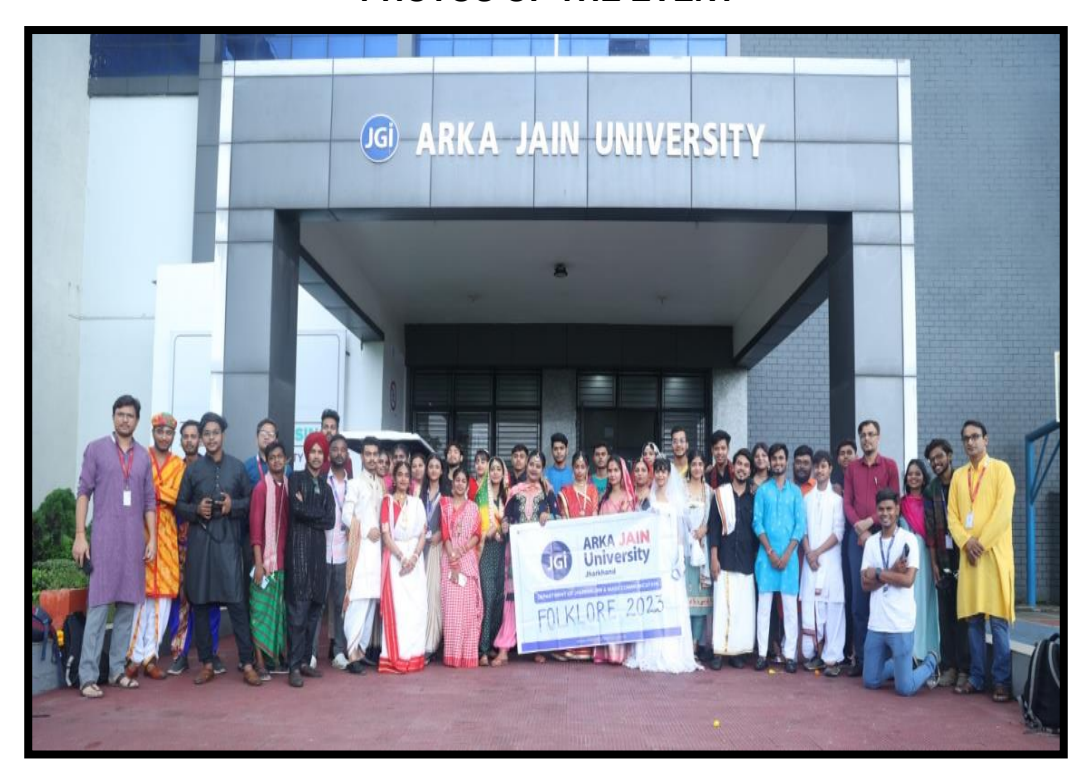
Figure 2: Participants and faculty members during Folklore event