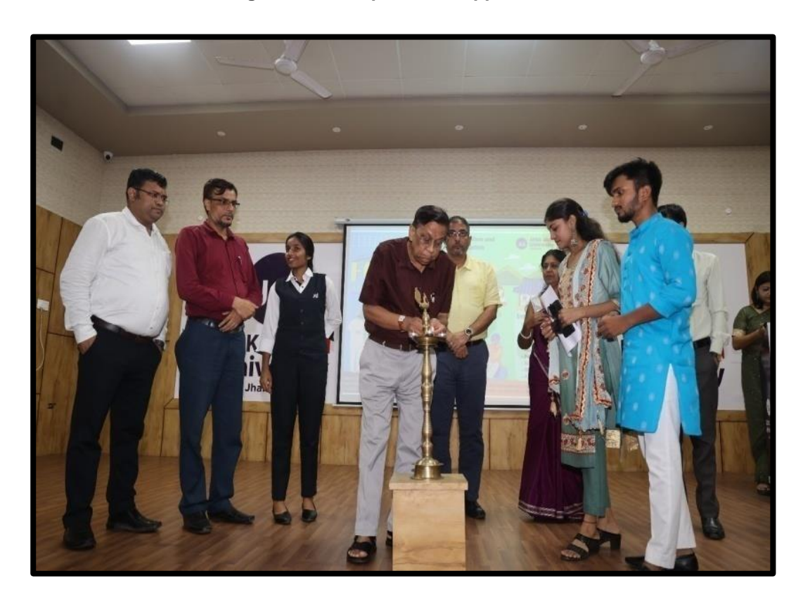
Figure 5: Honourable dignitaries jointly with Head of the departments and Students inaugurating the Folklore event by lamp lighting