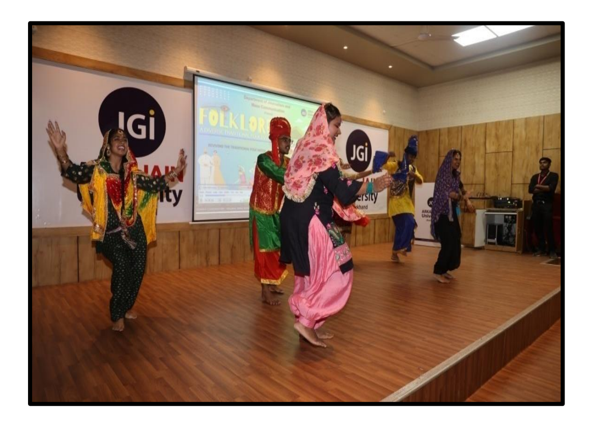
Figure 3: Participants doing traditional dance during Folklore event