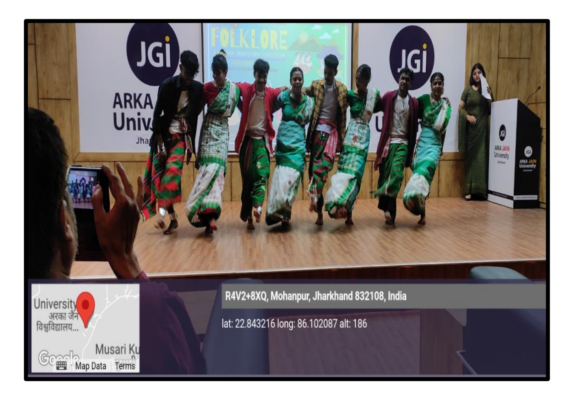
Figure 7: Participants doing tribal dance during the event