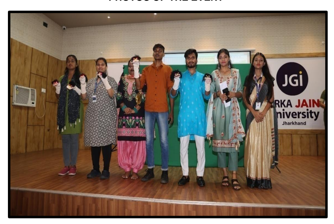
Figure 4: Participants of Puppet Show