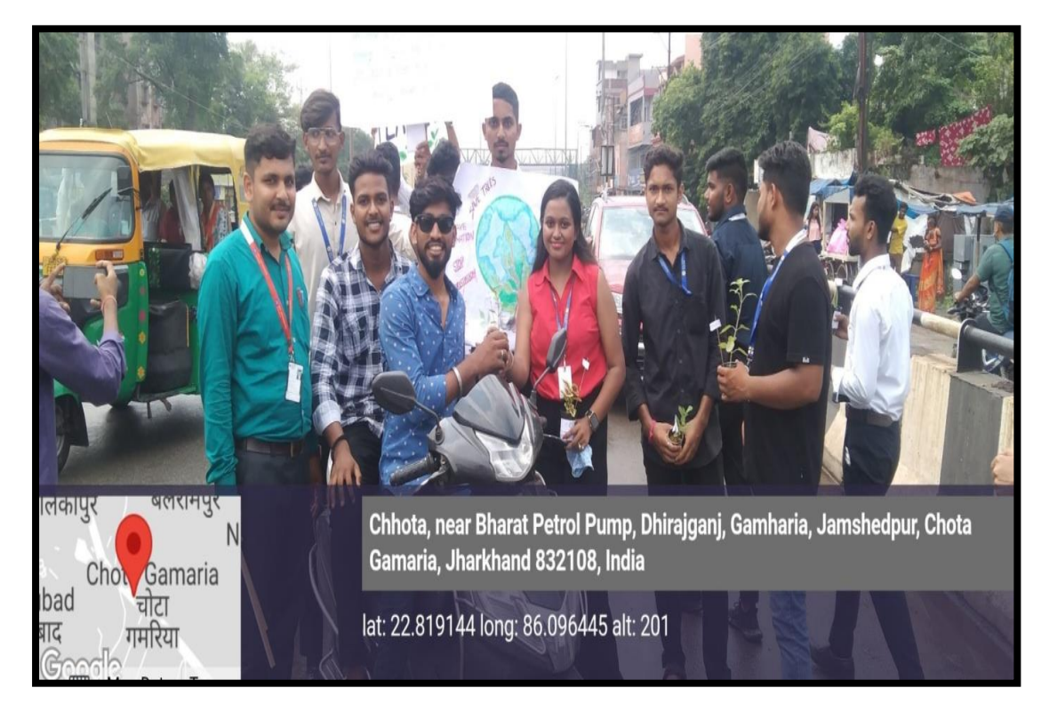
Figure 3: Students Take Charge in Plant Distribution and Public Awareness