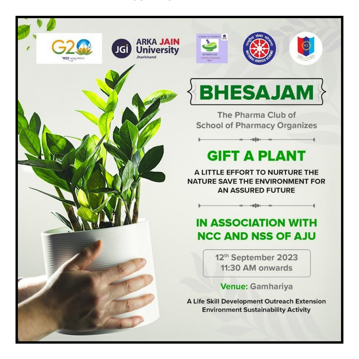
Figure 1: Poster of the event "Gift the Plant"