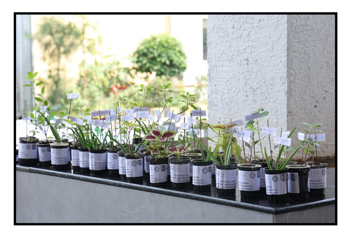
Figure 4: Plants Decorated by Students for Gifting