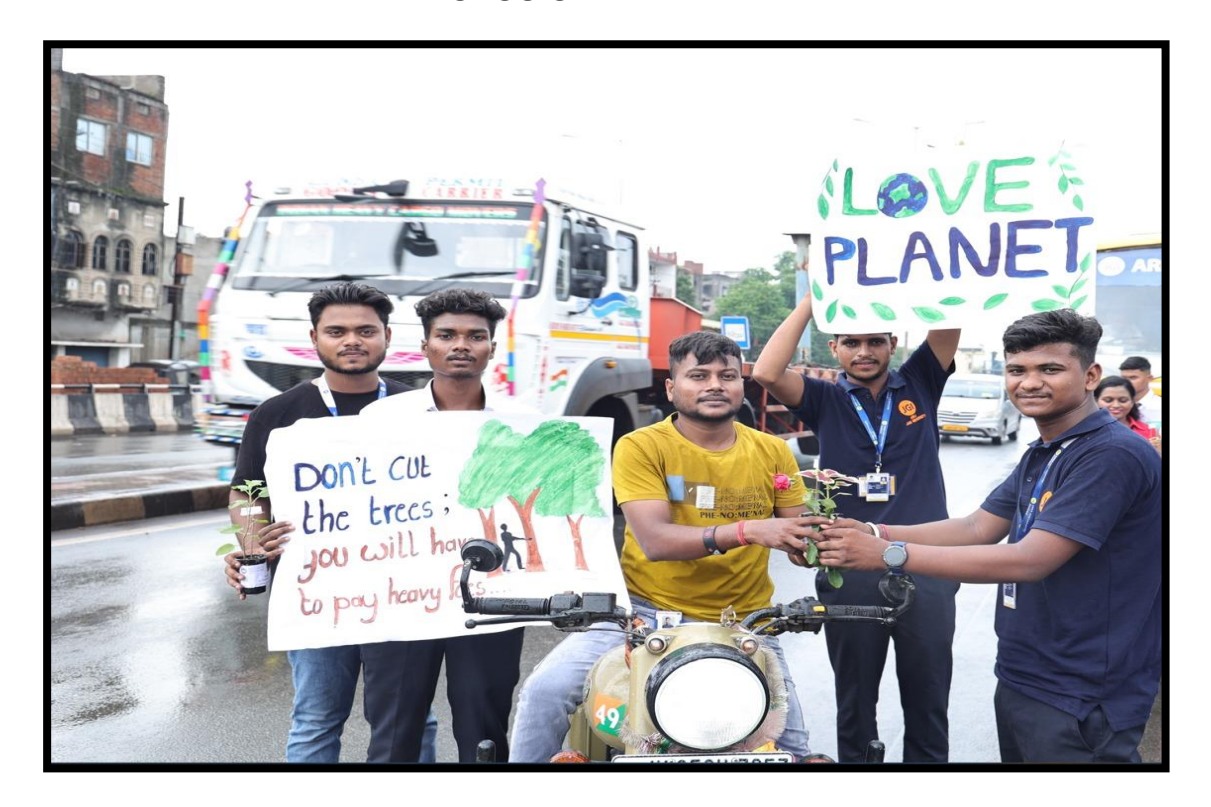
Figure 6: Young Minds Cultivating Awareness through "Gift a Plant"