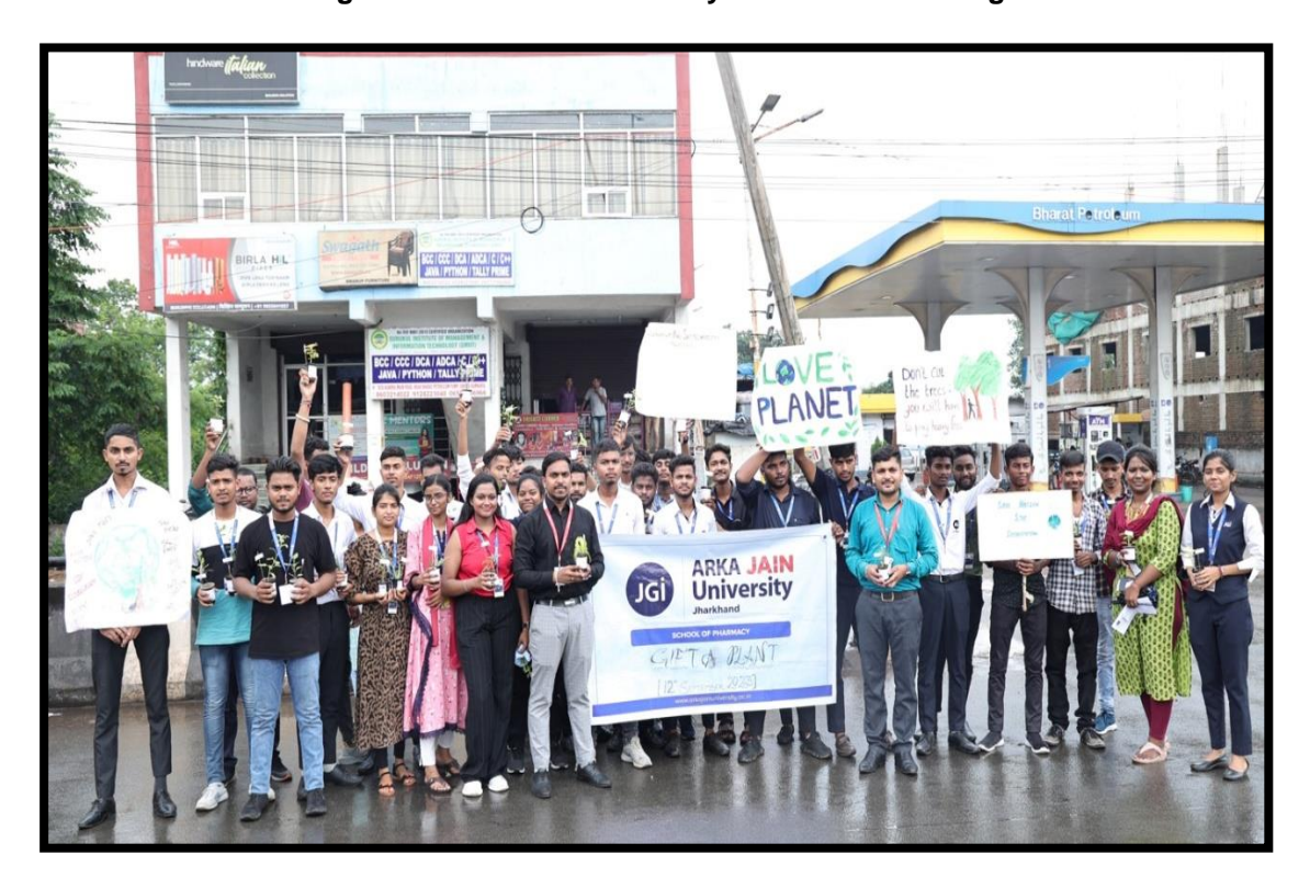
Figure 5: Students with faculty members, participating in the "GIFT A PLANT" event