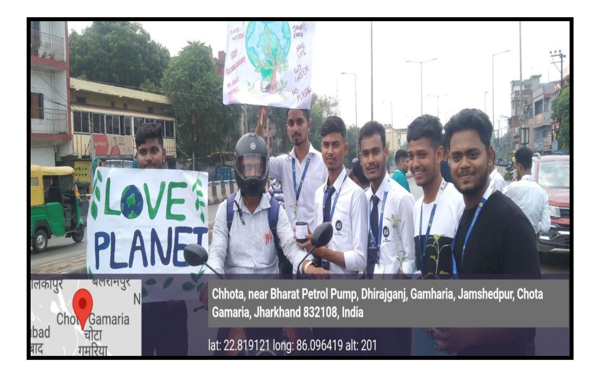
Figure 2: Students Distributing Plants and Creating Awareness among the Public