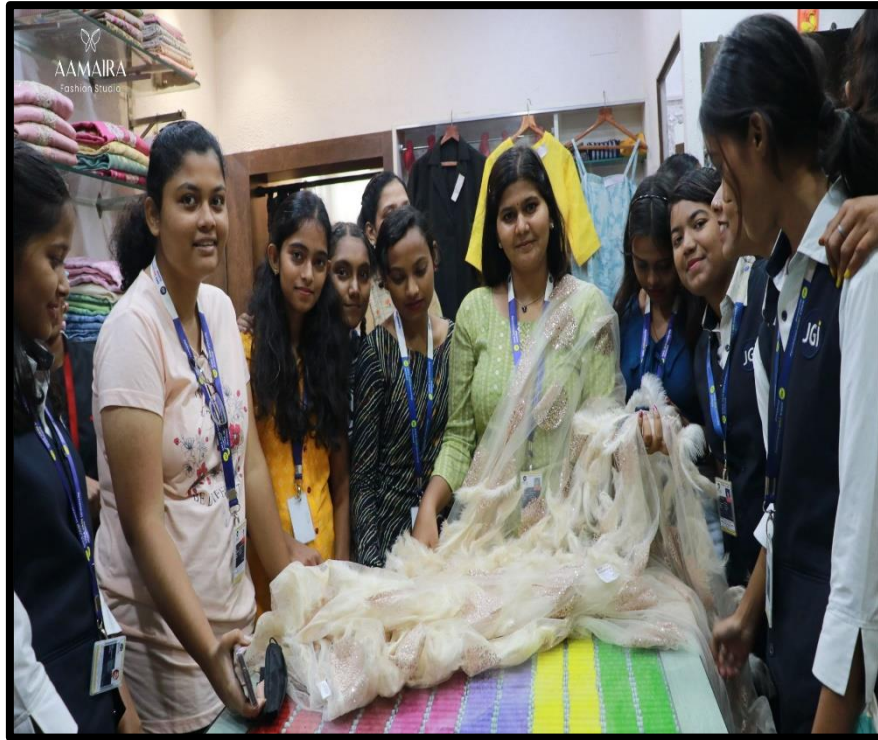
Figure 5: The design students engrossed in fabric exploration