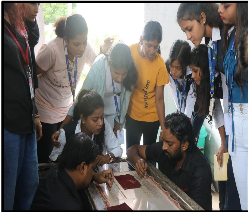
Figure 3: The design students understanding the embroidery process being executed by the Karigars