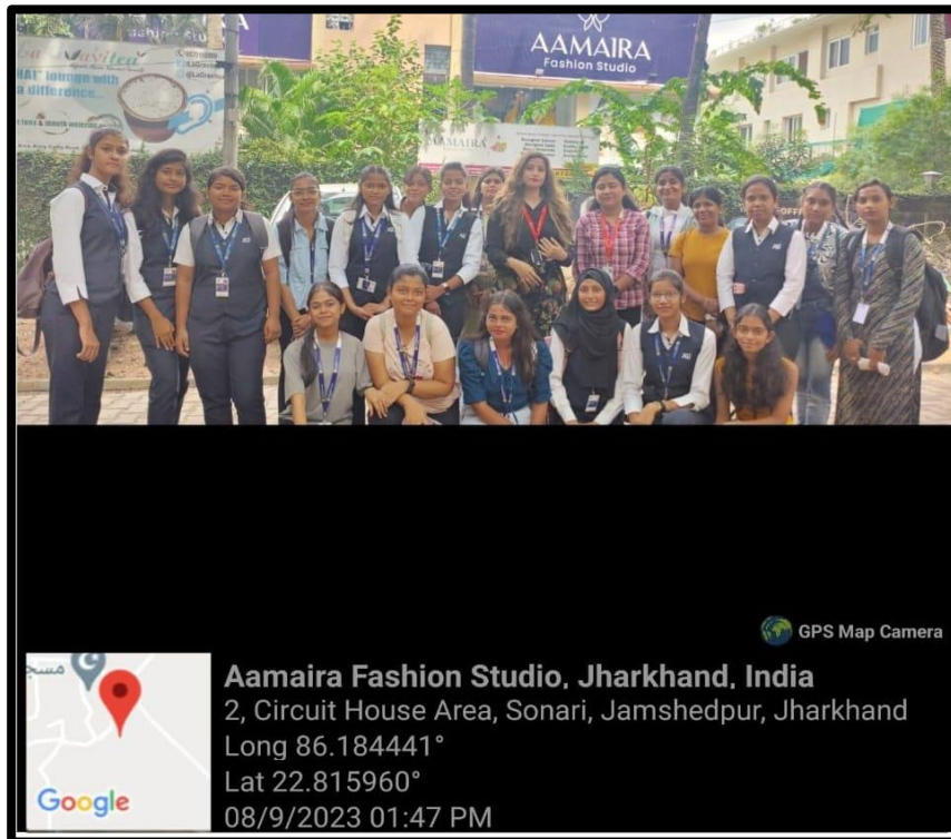
Figure 2: Students along with Faculties ready to meet the Team of Aamaira