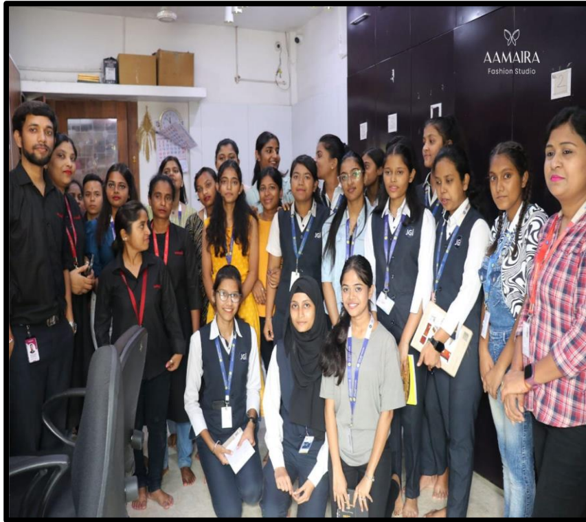
Figure 7: The team members and fashion design students posing for a group photograph in the Costing Room