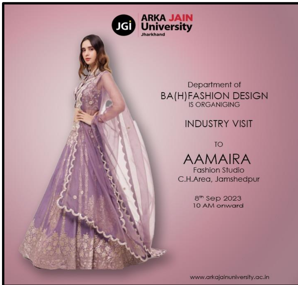
Figure 1: Poster of the event “Industry visit to Aamaira Fashion Studio”