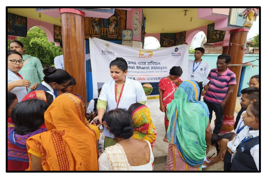
Figure 7: Distributing snacks to the participant after the event