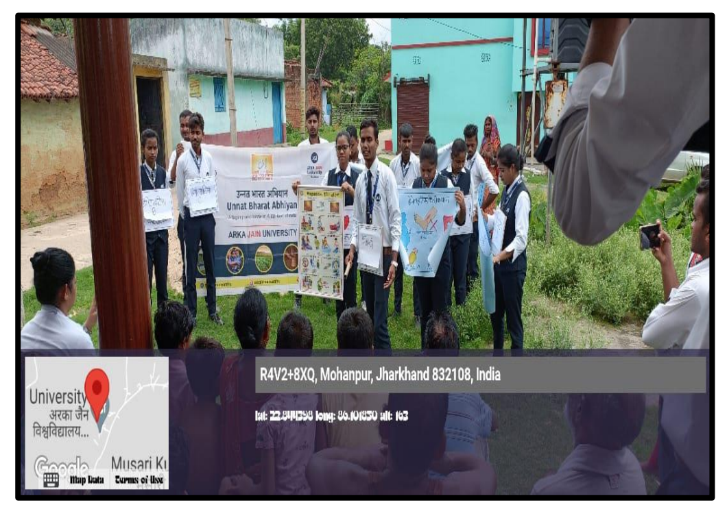
Figure 3: Skit Presentation by the Nursing Students