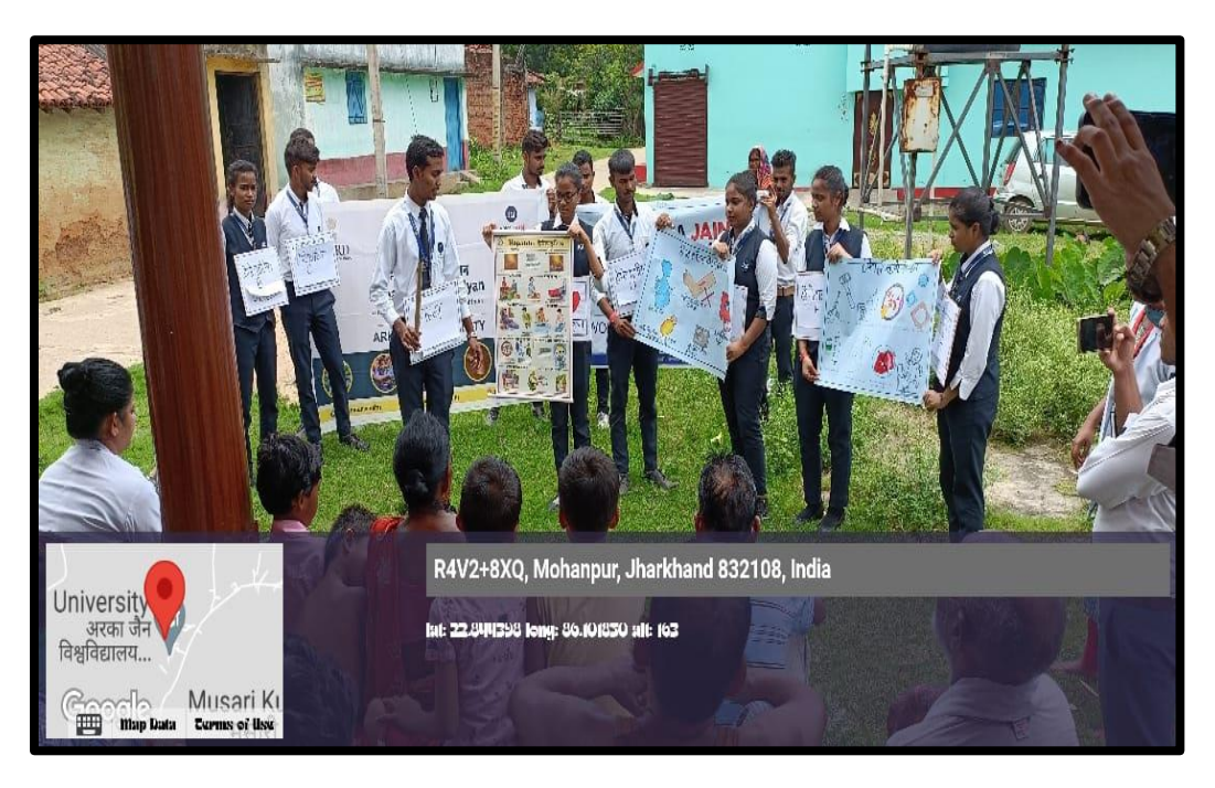
Figure 6: A skit illustrating the prevention of Hepatitis