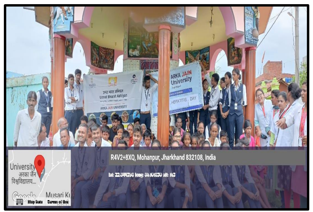
Figure 4: Group Photos of along with the Participants