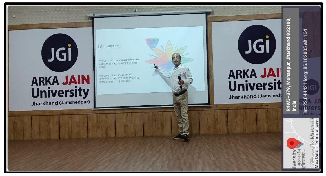
Figure 3: Photo of Session on Emotional Quotient and Emotional Well Being