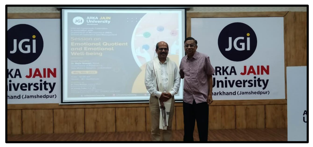
Figure 4: Photo of Session on Emotional Quotient and Emotional Well Being