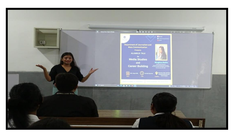
Figure 4: Guest speaker while giving career guidance to the students