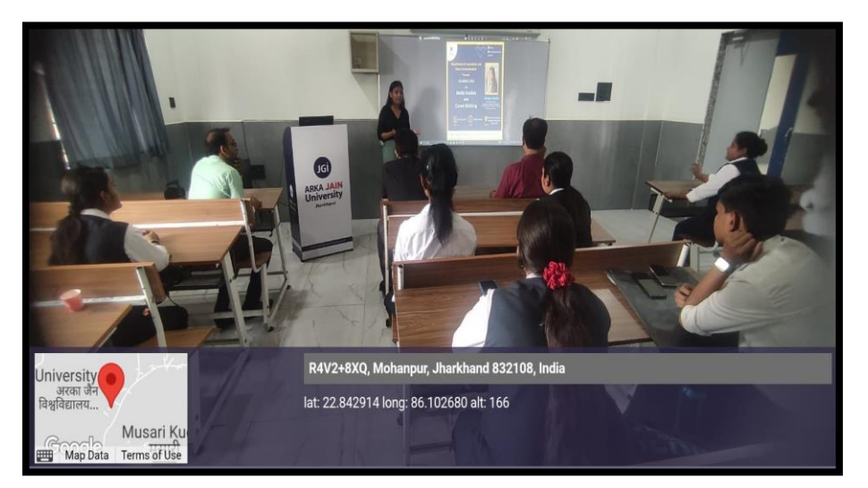
Figure 5: Guest Speaker while answering questions of students during Q&A session