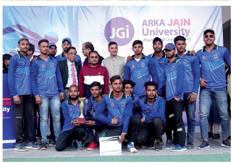
AJU Cricket champion team of Runbhoomi-2020(School of Engineering & IT) with the management with their Tropy