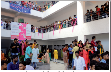
AJU students while celebrating at campus

The 2nd day began with a workshop called 'Jugaad'. It was an interactive session on how to Improvise the everyday life. Then, a team of 5 members were formed for an exciting task and the winning team got movie tickets. The day ended with a session of art of living.