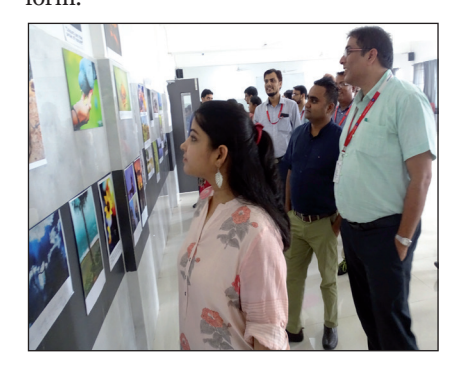
AJU Management and guests while exploring the photographs in the exhibition

photography skills help students to capture and render their story in a digial form.