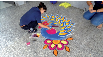
A Glimpse of Extracurricular Activities at Arka Jain University, Jharkhand

Tube Dress. The second garment was a very well-structured garment in off-white. This represented Peace. White also is the presence of all colours and we represented it through this garment. The third garment was a purple dress made of draping. The accessories were all uniquely made by the department – necklaces made of zippers and safety pins. The backdrop was conceptualized to be a colourful cloud with rain droplets in colours. The background would be newspaper print with students’ work displayed on the same. A seating was also adorned using the strips of fabric. The Colourful Platonic Solids were used to adorn the entire look and the setup was finished with display write-up. The entire process of creating the garments, accessories and décor took a month’s time and the patience and hard work of the entire department. This exhibit also became a live project for the students which they could use as a part of their portfolio. It was also a first-hand experience on Visual Merchandising.