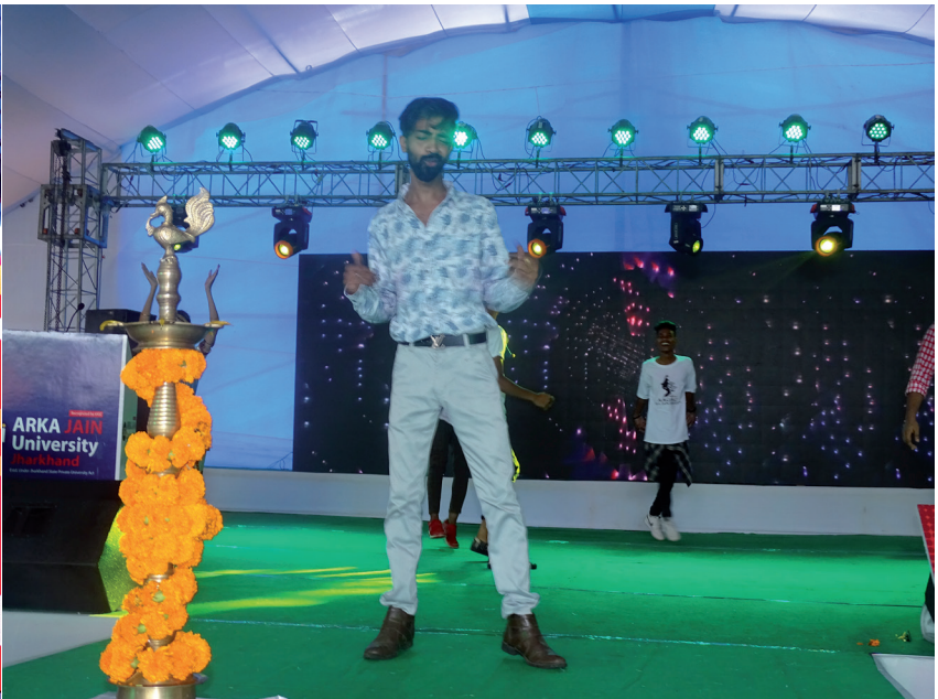
Students performing on the stage in Aagaaz 2019 at ARKA Jain University