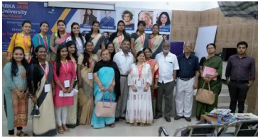
Department of English organised a Two-Day Seminar on "Indian Fiction Today".