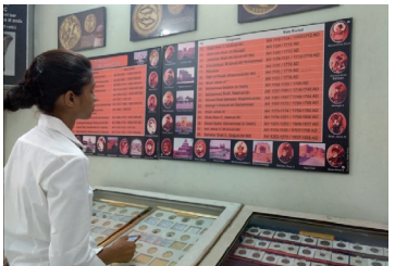
Students of Department of Fashion Design visited to the Coin Museum which is one of the best museums in the city of Jamshedpur and as a matter of fact, the best museum in the state of Jharkhand as well.