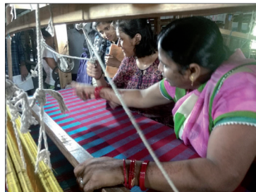
The students of Fashion Design Department visited the Weaving Centre - Bunkar Prasikshan Sah Utpadan Kendra in Parsudih, Jamshedpur