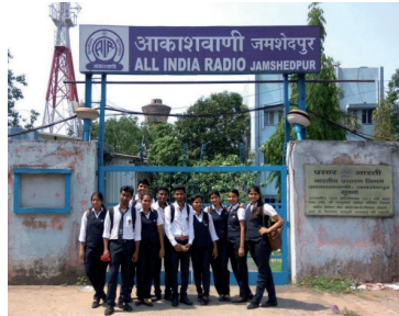
Department of Journalism and Mass Communication organised a visit to All India Radio and learnt about radio production and radio work culture