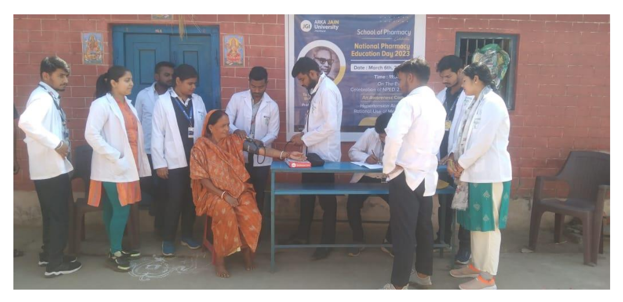
Hypertyension Alarm the Awareness Camp During Observation of National Pharmacy Education Day