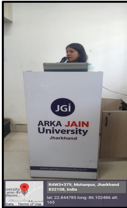
Figure 2: Guest Speaker addressing the students