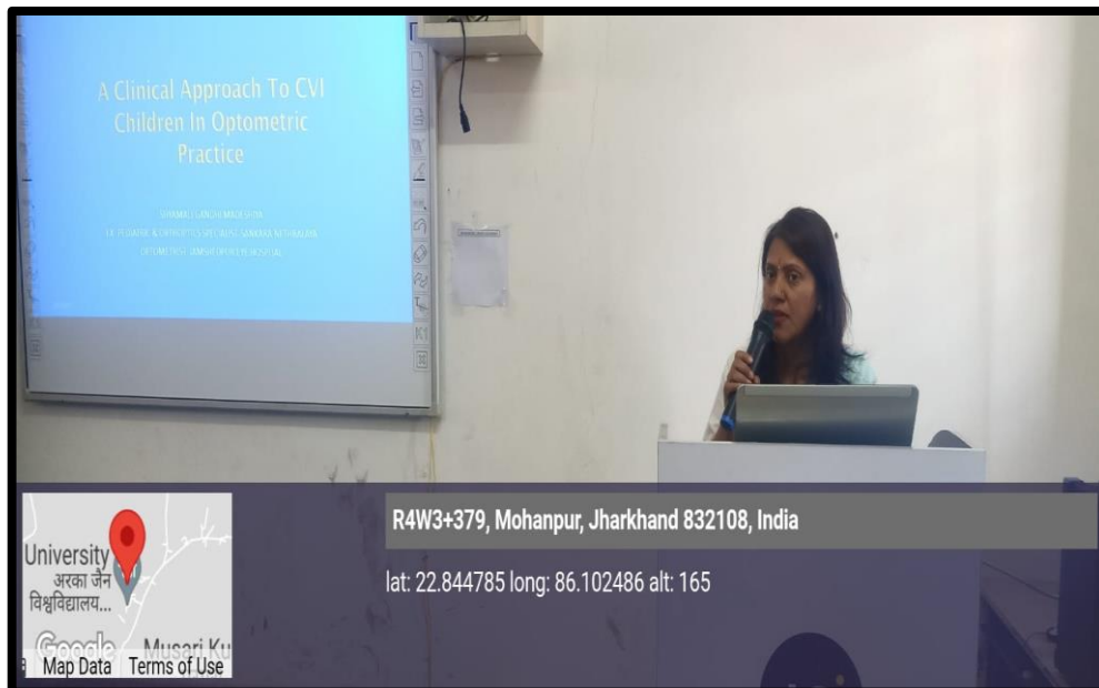
Figure 3: PPT Presentation by the Guest Speaker