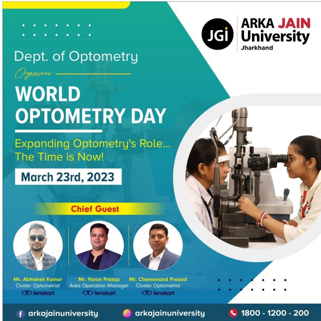
Poster of the Event: World Optometry Day 2023