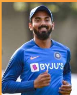
K. L. RAHUL