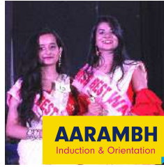
AARAMBH Induction & Orientation