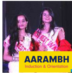
AARAMBH Induction & Orientation