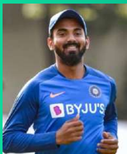
K. L. RAHUL