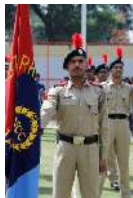
CARVAAN An Annual Expedition of AJU