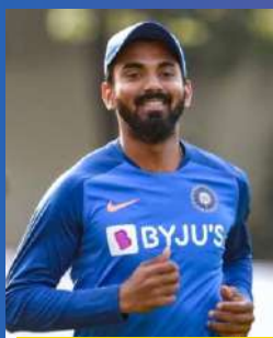
K. L. RAHUL