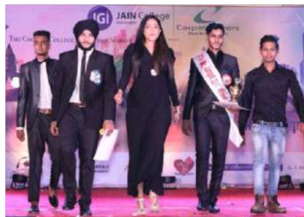
AAGAAZ An Annual Cultural Fest