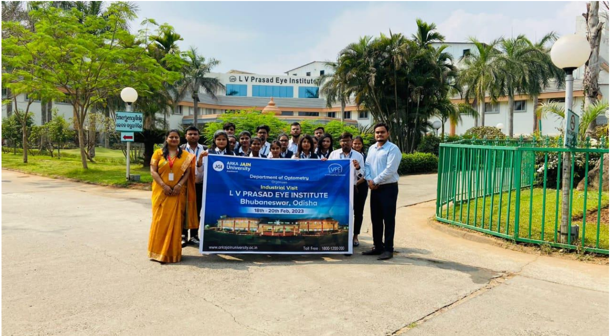
Students assembled at the entrance of LVPEI, Odisha