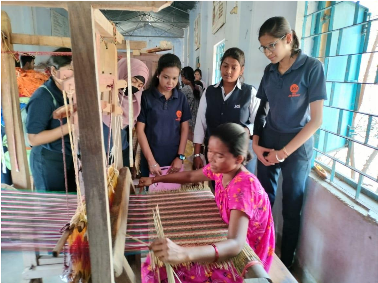
Students understanding the Motions of the Loom in Grass mat Weaving