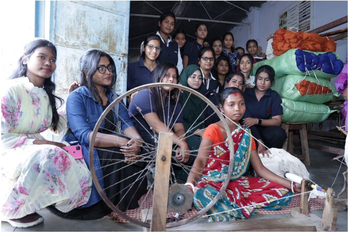
Students with the Artisan on the Spinning Wheel