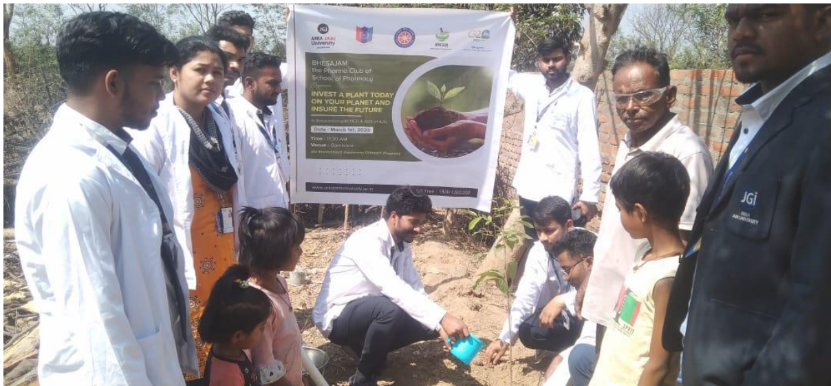
Irrigating the plant after plantation