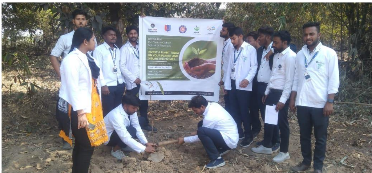
This will not be stopped here