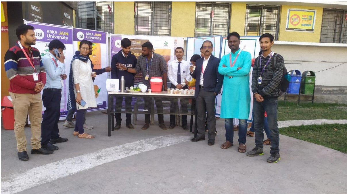
Can I offer a cup for you? I assure, this cup will definitely cause a smile for the needy one