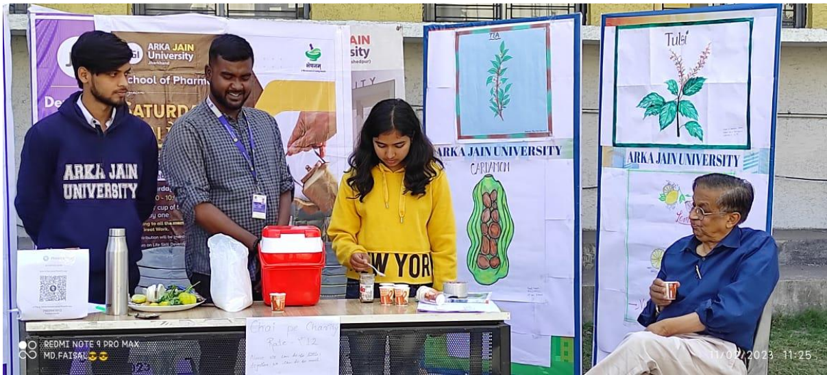
Appreciating your effort my dear student