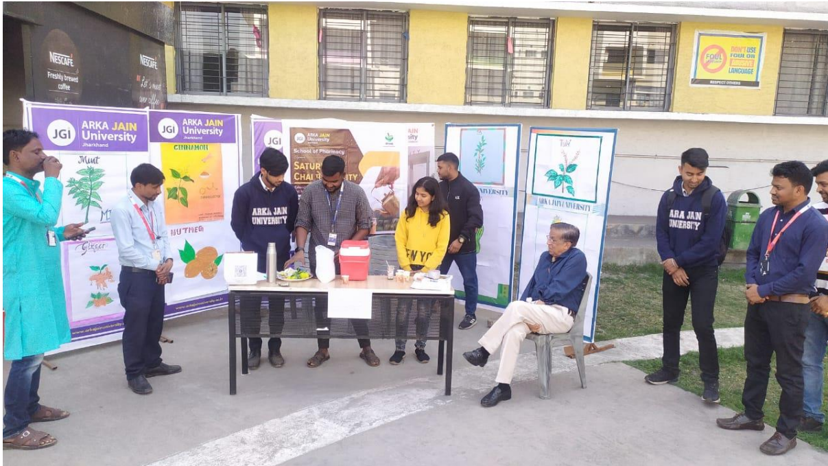
Our Vice Chancellor Sir with the students in a relaxing mood