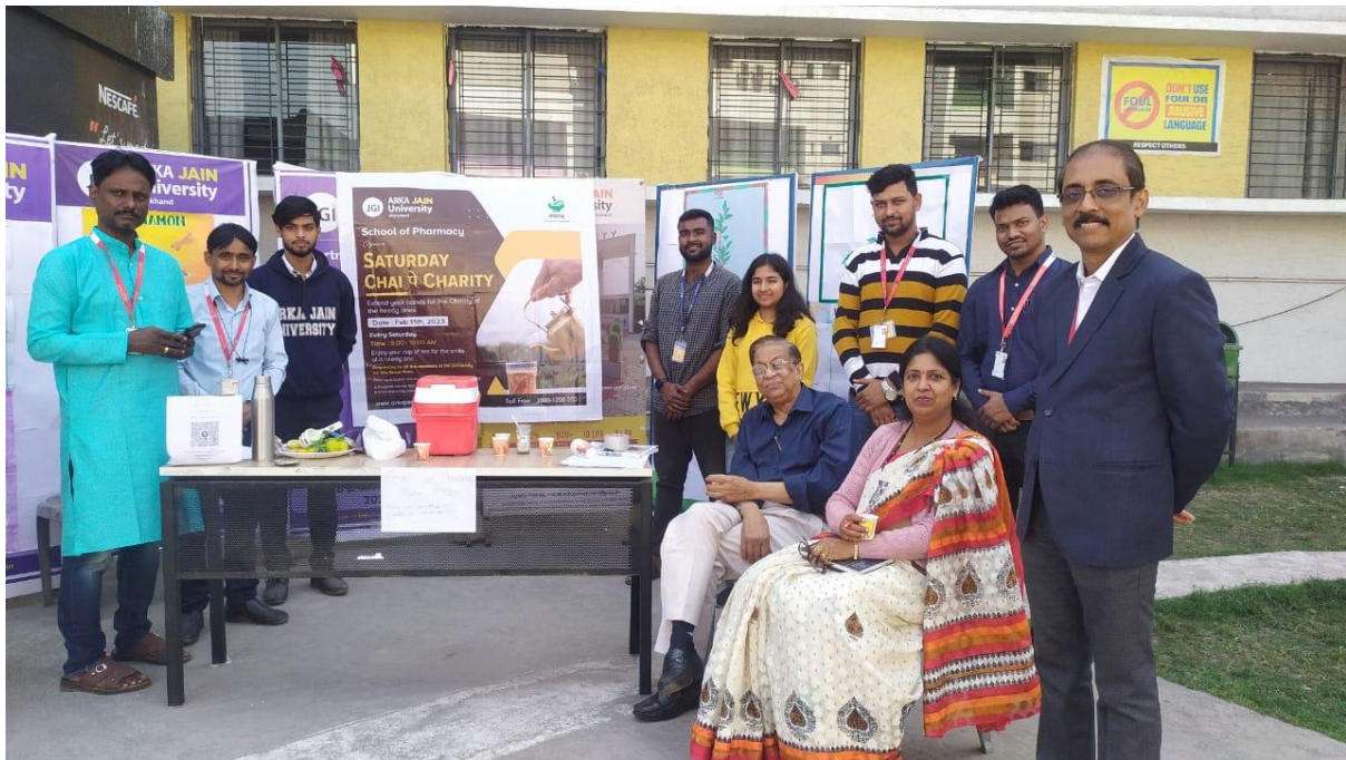
The taste of Chai comes with company only