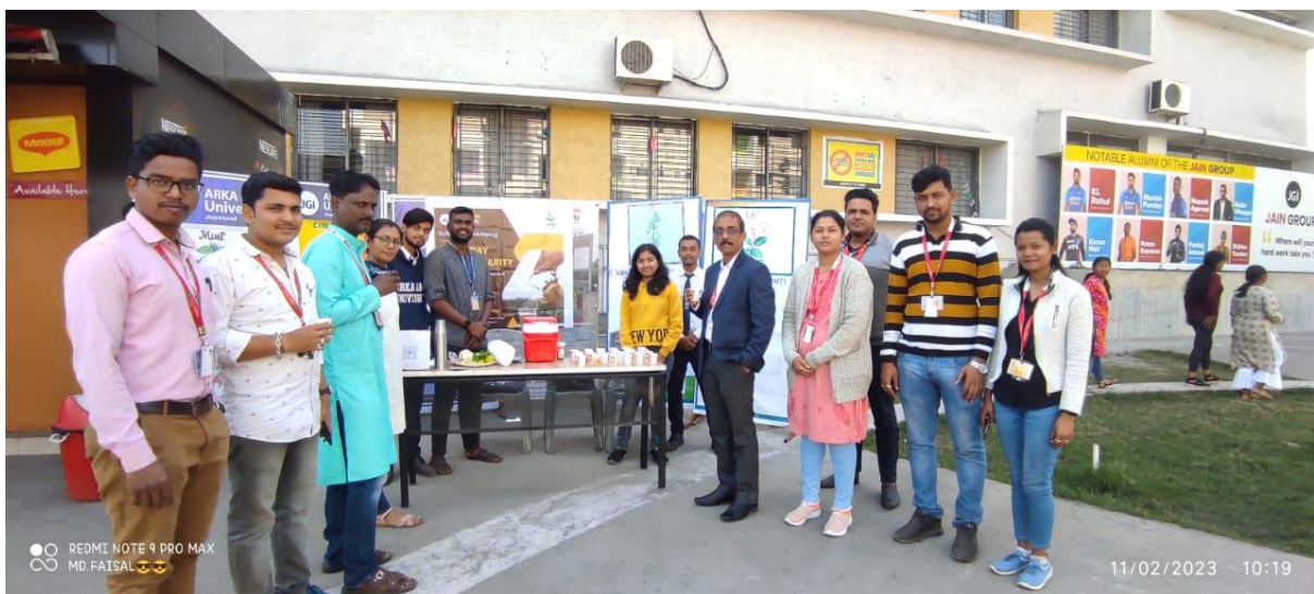
Student organizers with departmental faculty members