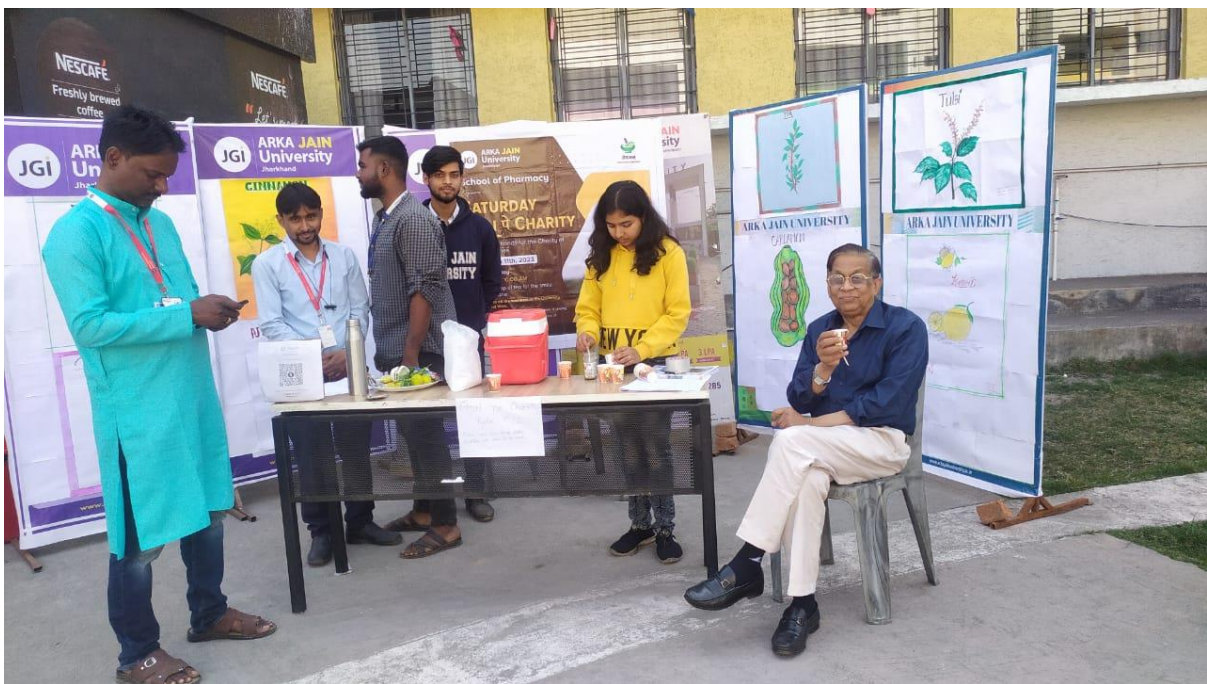
It's really stress relieving and amazing