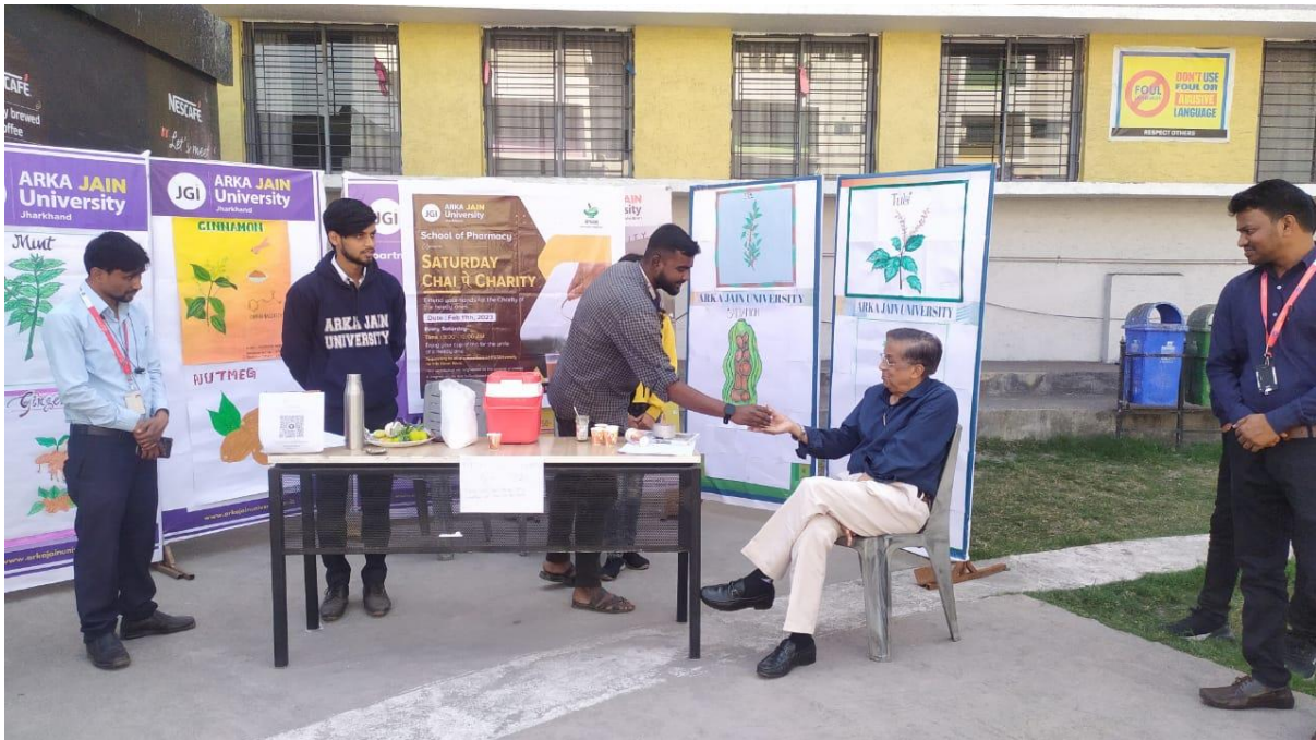
Honored to serve a cup of Charity wala Chai for you Sir