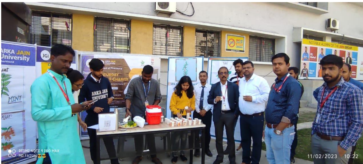
Witnessed by Members of IQA Cell