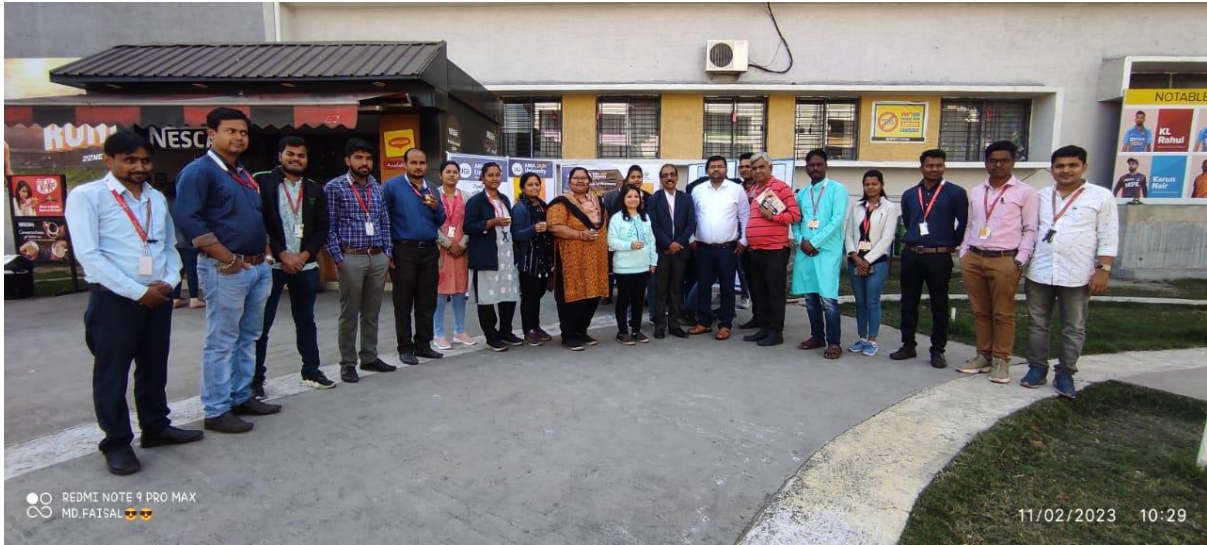
Friends are the main resources for the Charity