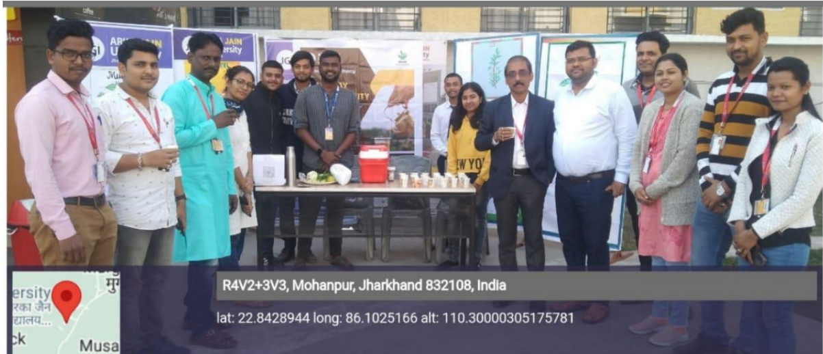
Charity begins from home and we start it from our School