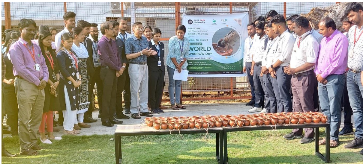
Honourable Vice Chancellor Addressing the Gathering