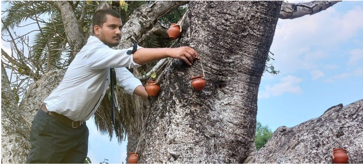
Student Placing a Pitcher filled with Water