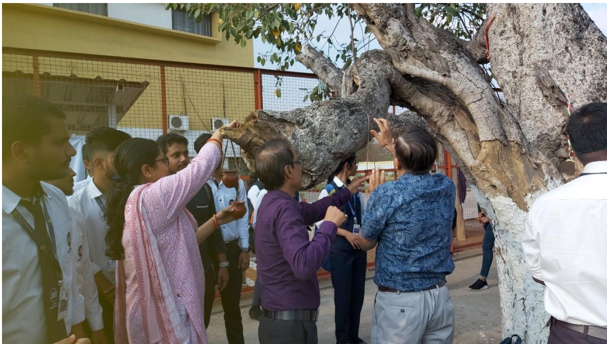
Placing the Water Filled Pitcher in Different Locations for the Birds