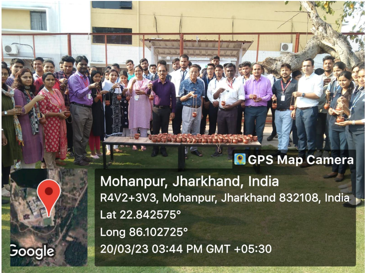
Witnessing the Event A Day for Birds II on 20 th March 2023