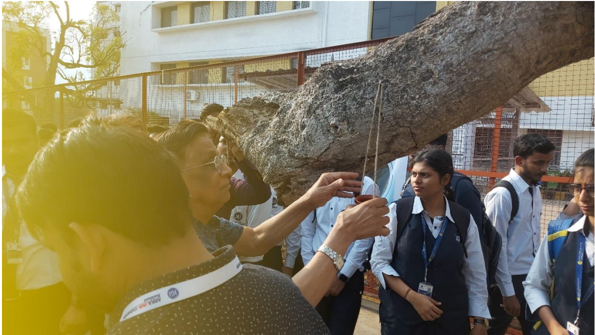
Honourable Vice Chancellor