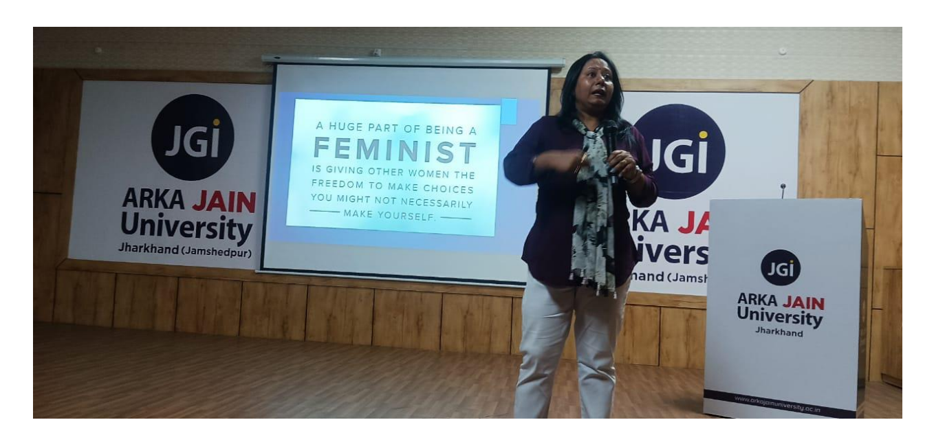
Photo of the Event: Session by External Expert: Facts and Myths of Feminism