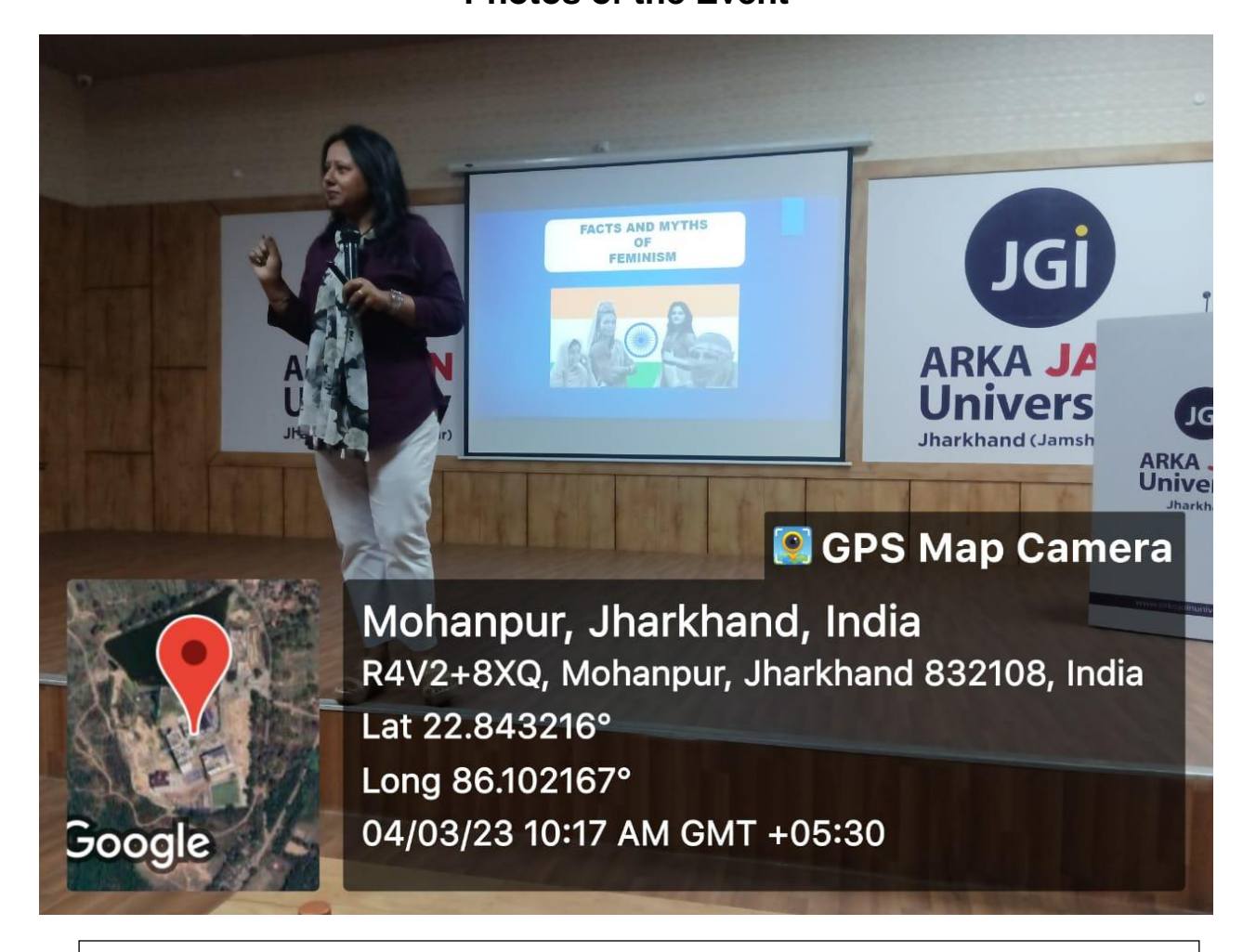
Photo of the Event: Session by External Expert: Facts and Myths of Feminism