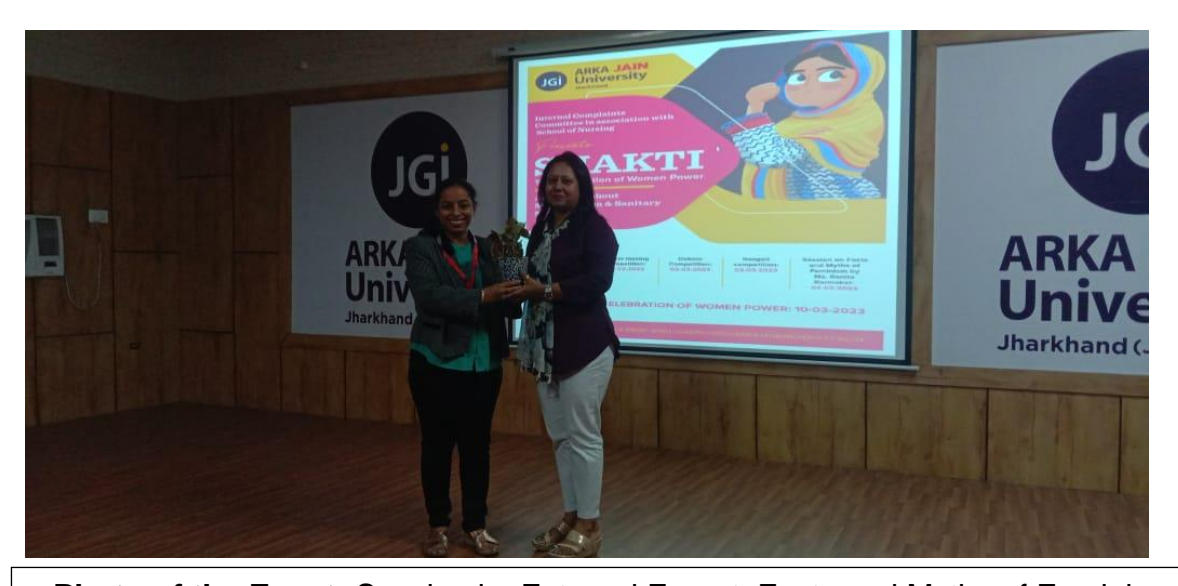
Photo of the Event: Session by External Expert: Facts and Myths of Feminism