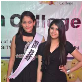
ROO-B-ROO Fresher's day - Ice Breaker For New Students