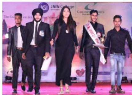
AAGAAZ An Annual Cultural Fest