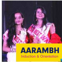
AARAMBH Induction & Orientation