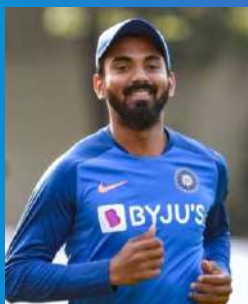
K. L. RAHUL