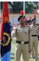
CARVAAN An Annual Expedition of AJU