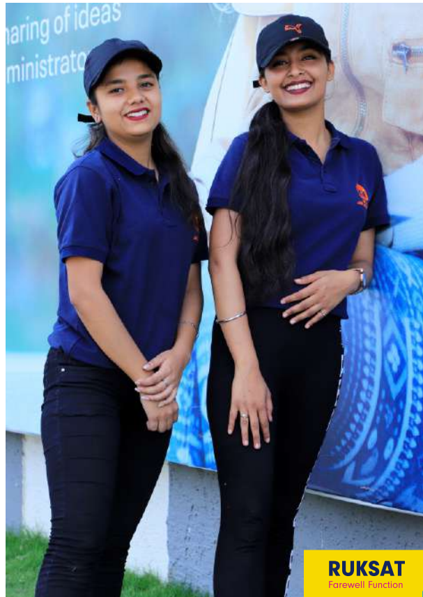
RUKSAT Farewell Function