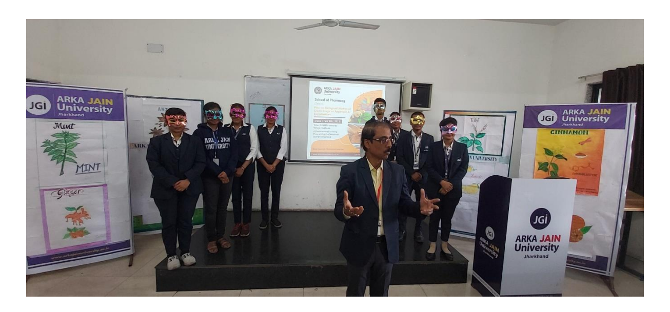
Briefing about the play