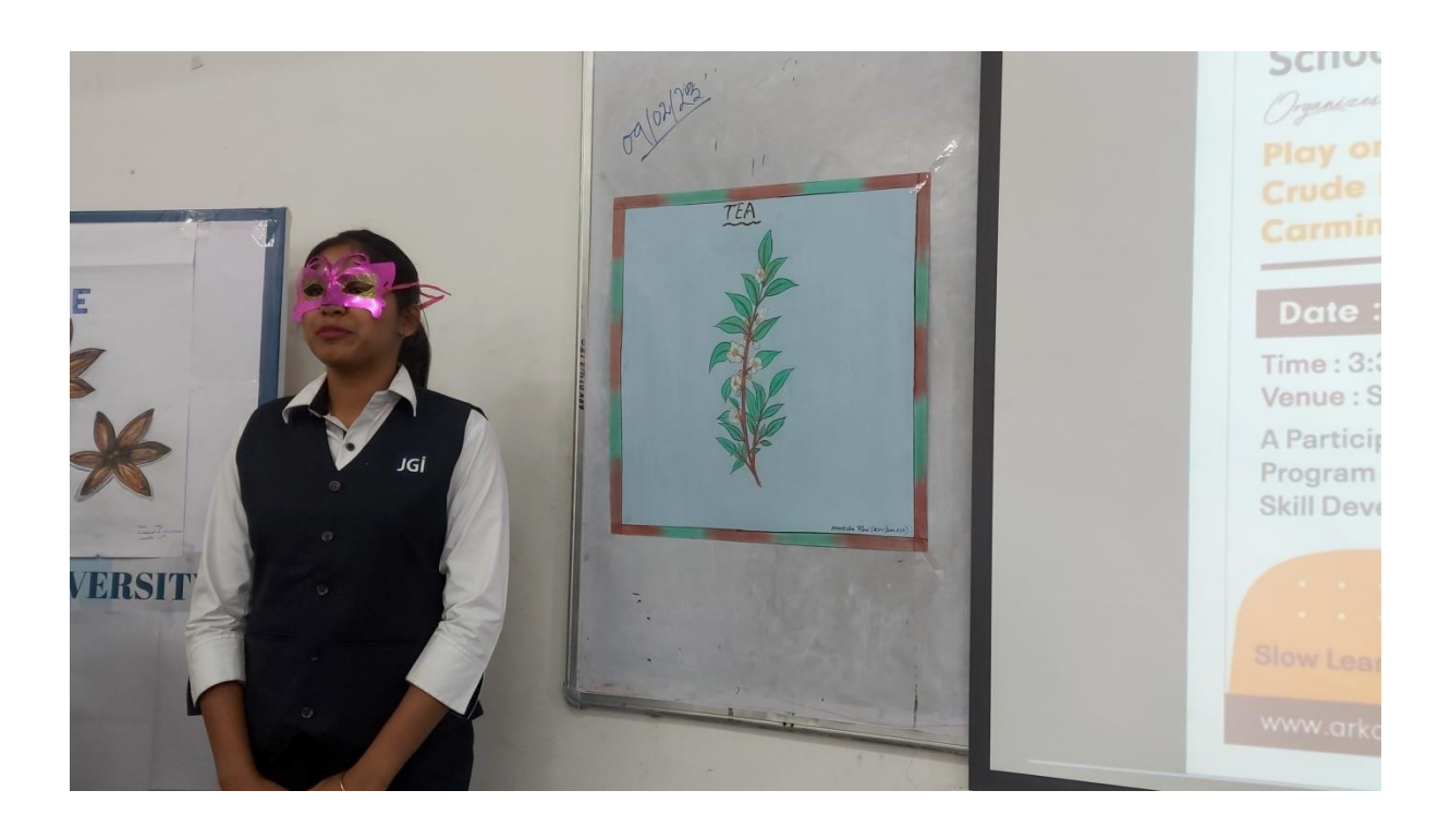
Playing the role of Tea