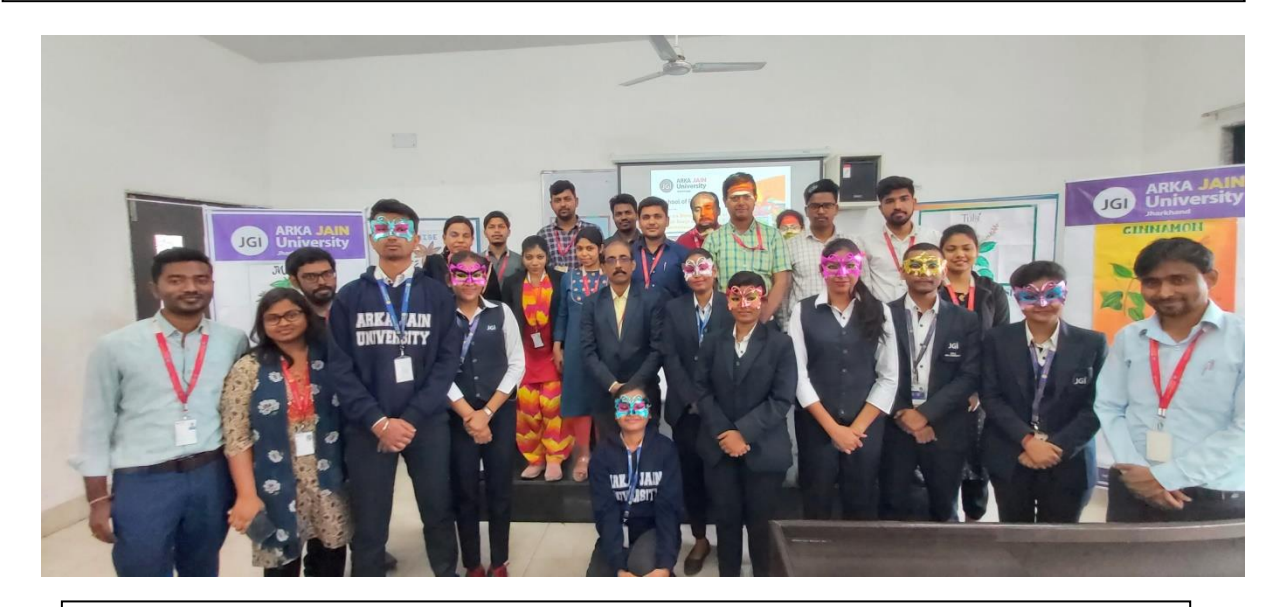
Teachers with participants

Students Participated in Play on Biological Studies of Crude Drugs as Appetizer and Carminatives