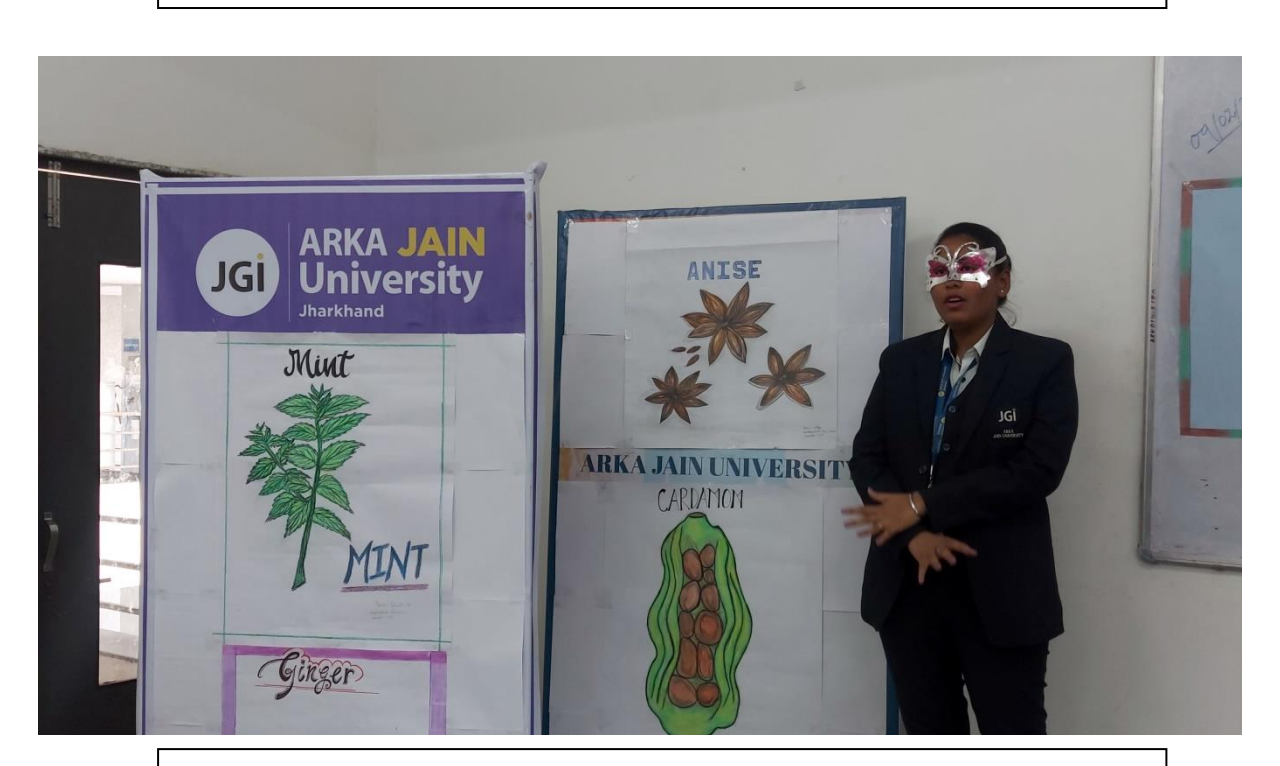
Playing the role of Anise