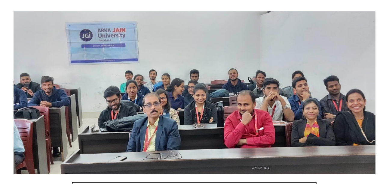
Faculties and students watching the academic play