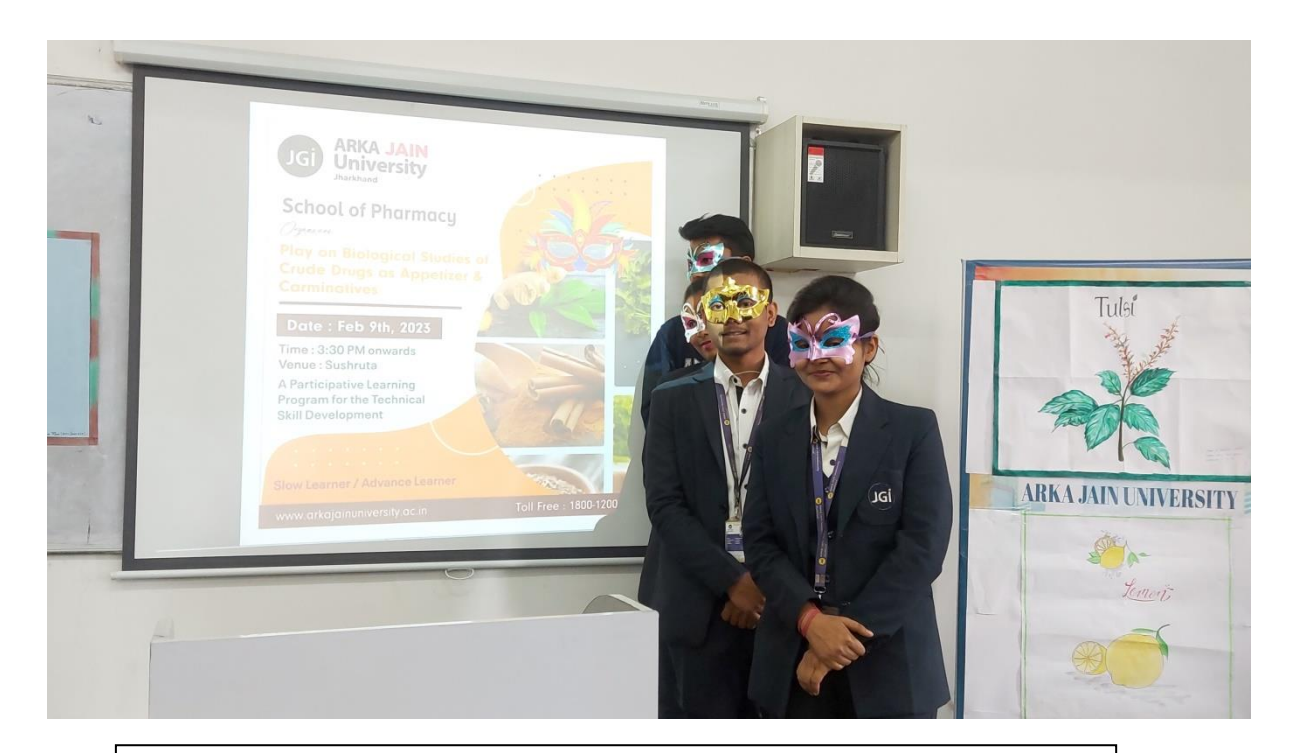
Participants in queue to perform the role