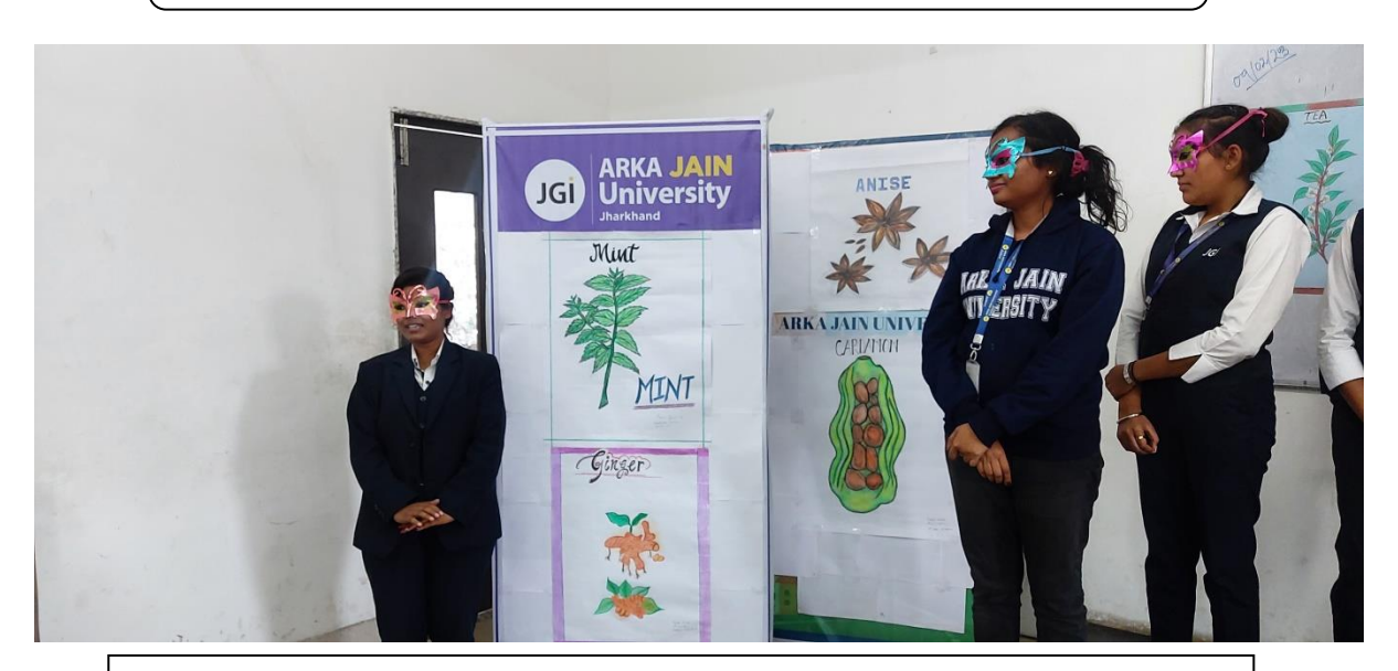
Student in the role of Ginger explaining its Pharmacognosy