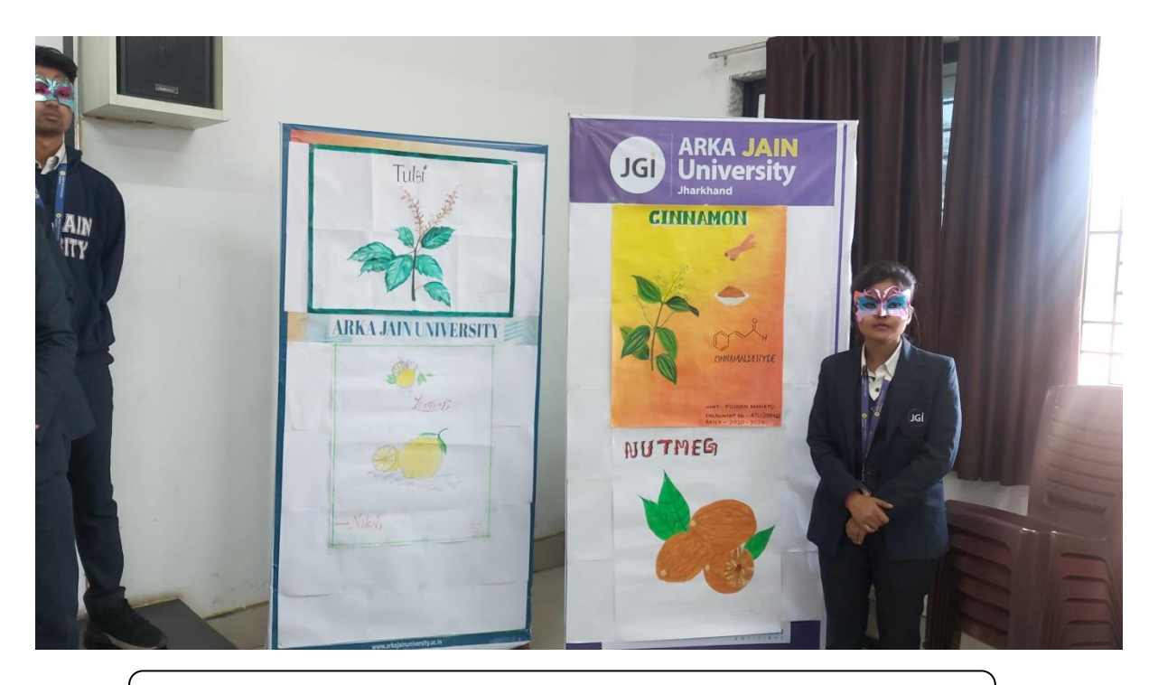
Student explaining in the role of Nutmeg