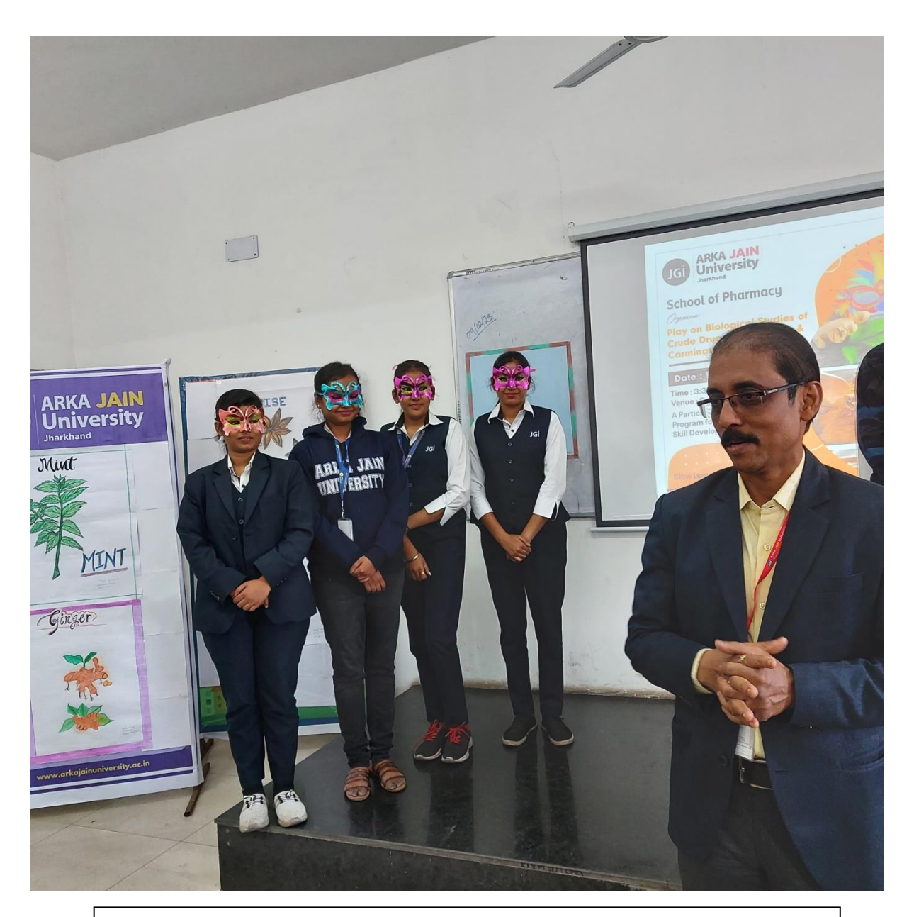
Curiosity among the students to start the session