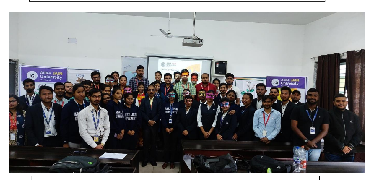
All under one frame