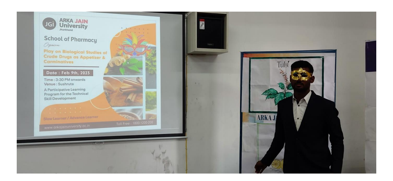
Playing the role of Lemon to explain its Medicinal properties