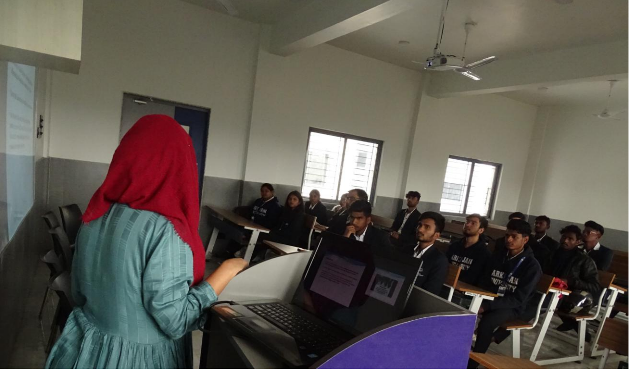
Fig: 1.2-Guest Lecture on News Gathering and Fact Finding Techniques