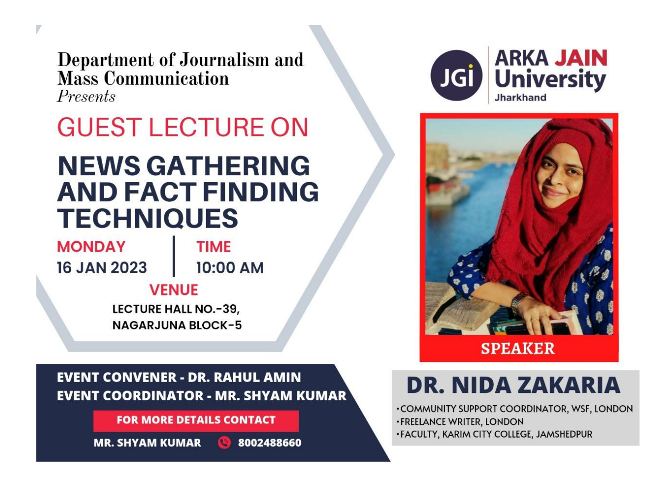
Fig.1.1- Guest Lecture on News Gathering and Fact Finding Techniques