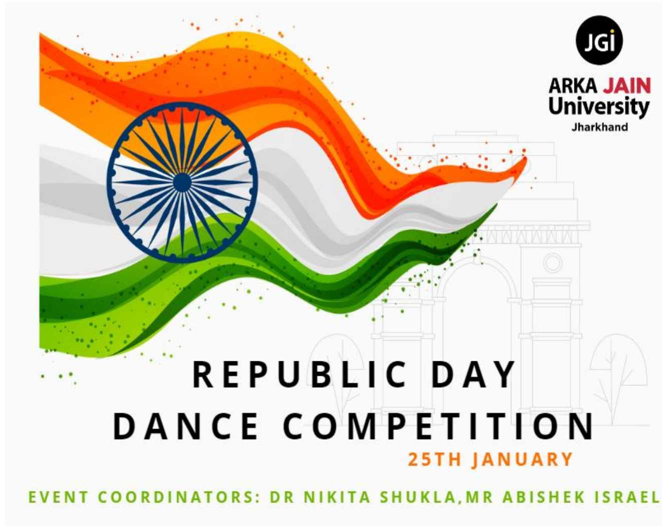
Poster of the Event: Republic Day: Dance Competition