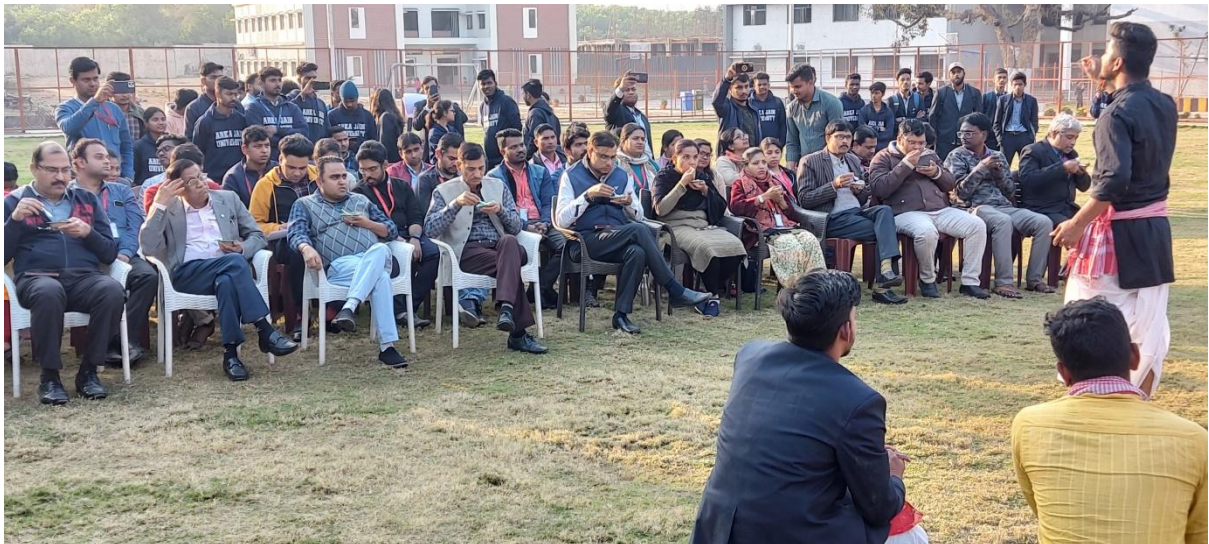
Dignitaries enjoying Makar Chawal a special Makar Recipe usually served in eastern Odisha