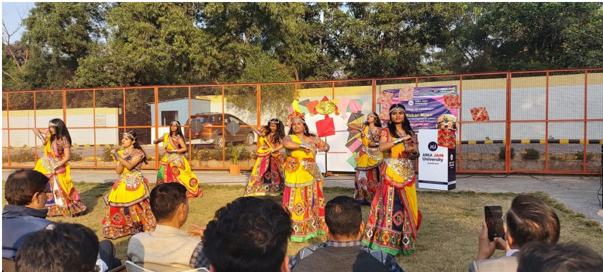
Students performing at Makar Milan