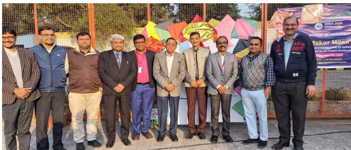
Dignitaries at Makar Milan