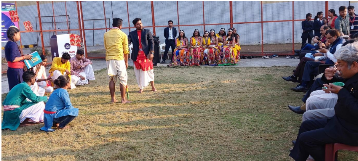
Nukkad natak by students during Makar Milan