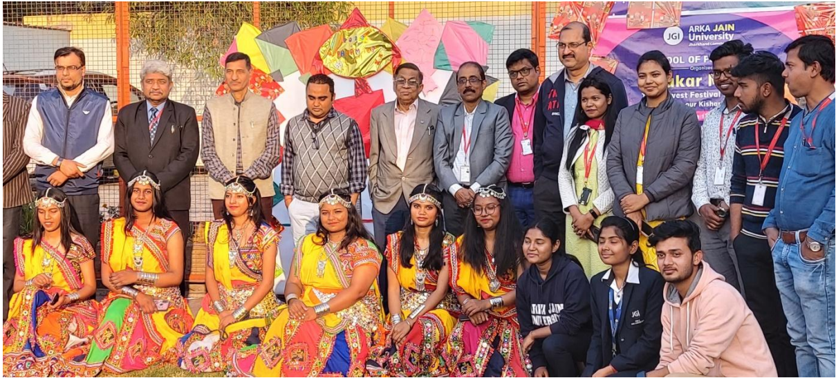
Performers and dignitaries under one frame