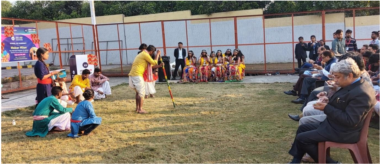
Dignitaries enjoying Makar Chawal