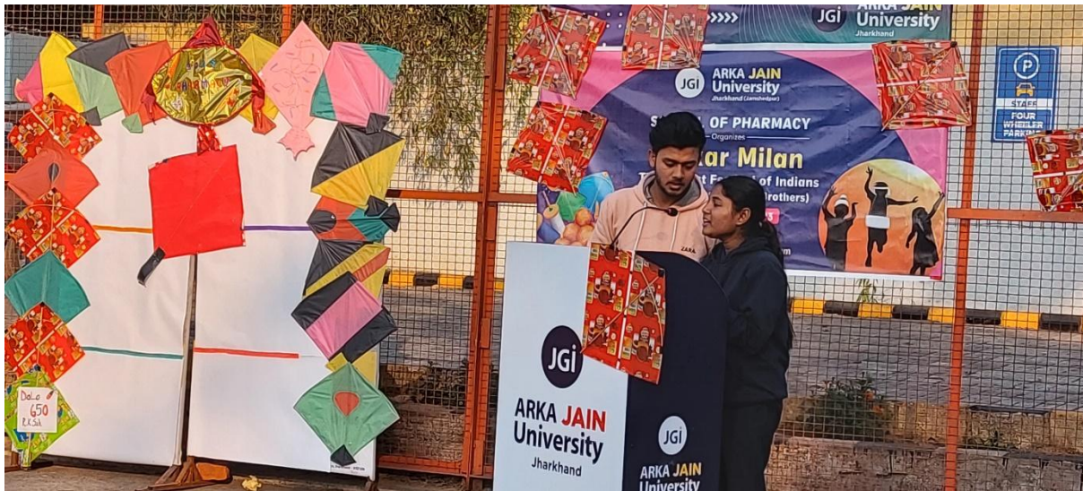
Students presenting harvesting song by the side of kite works by the students