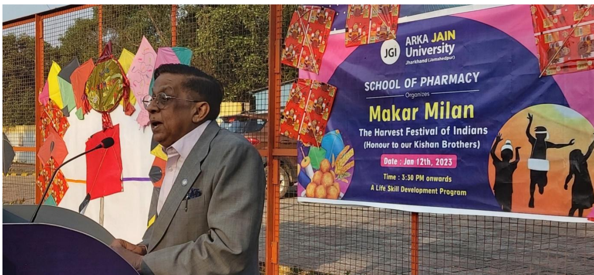
Vice Chancellor addressing the gathering at Makar Milan