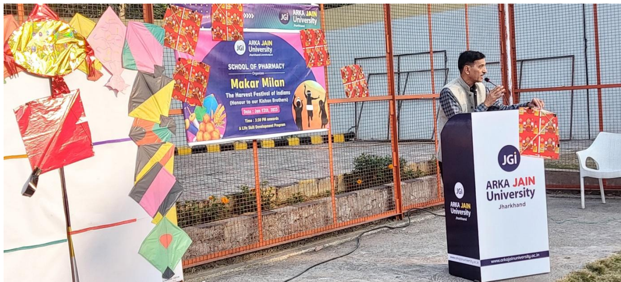
Director Campus of AJU addressing the gathering at Makar Milan