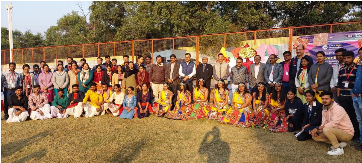
Faculties, performers and dignitaries under one frame