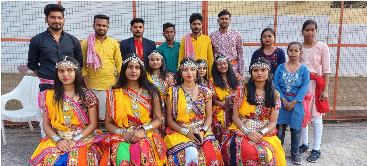
Student Dance performers at Makar Milan