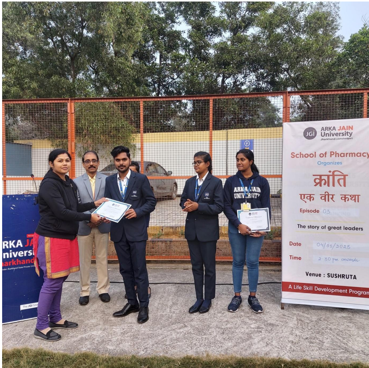
Teachers felicitating the winners