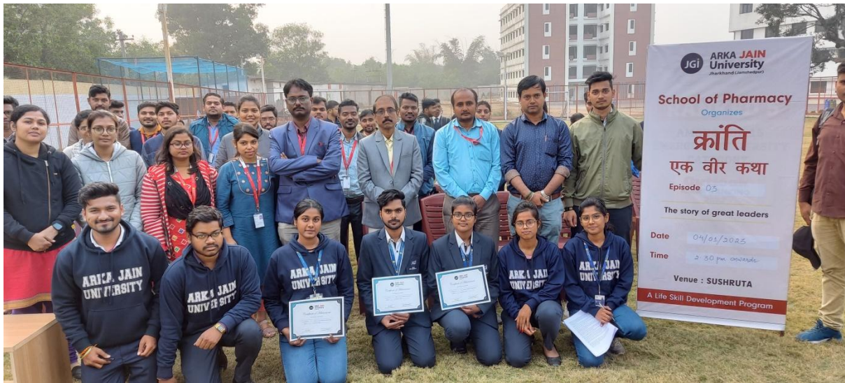
All under one frame