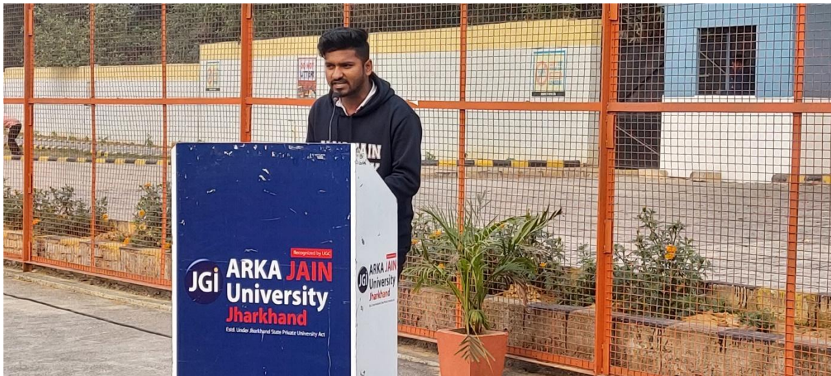
Student telling the story