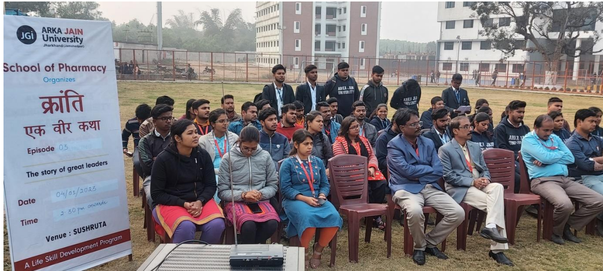
Kranti Ek Veer Katha Episode III