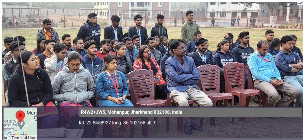
Participants at Kranti Ek Veer Katha Episode III