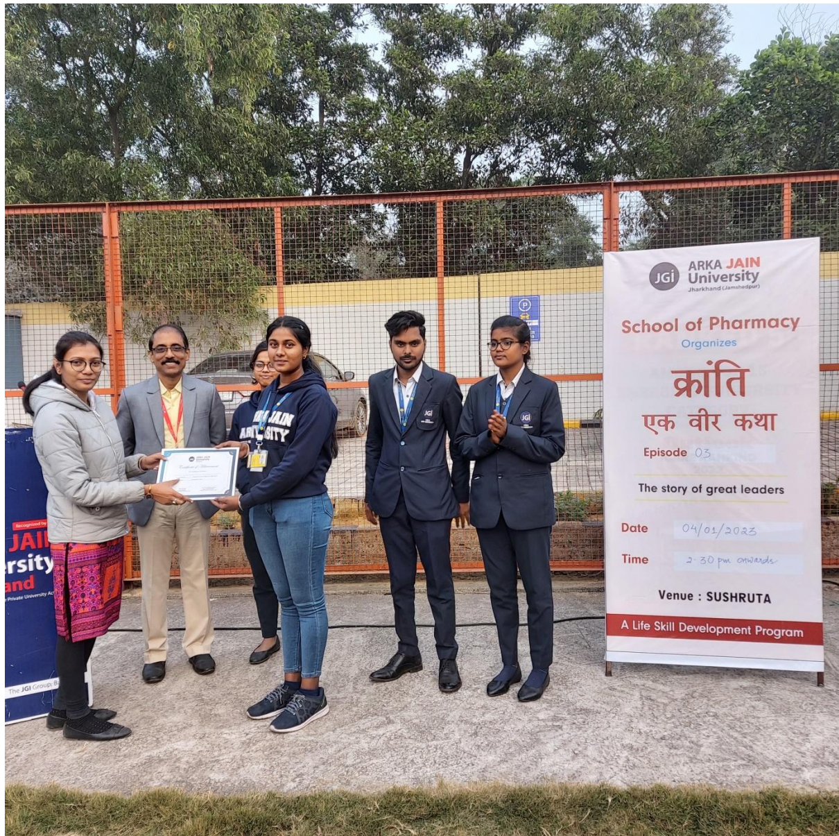
Winners accepting certificates