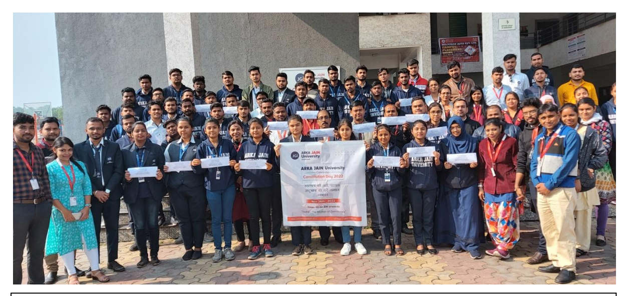
Students and faculties with the tag line issued by School of Pharmacy as every year....this time it is स्वतन्त्रता की सही पहचान, राष्ट्र भाषा को करें सम्मान