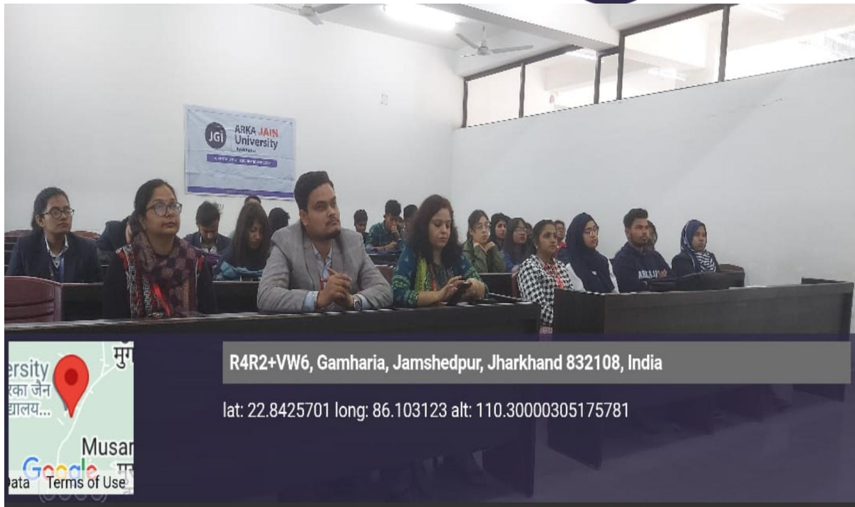
Students of Biotechnology and Optometry department attending the webinar