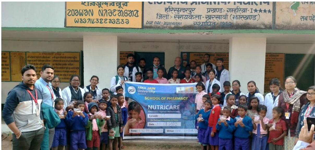
At Harisundarpur Prathamik Vidyalaya