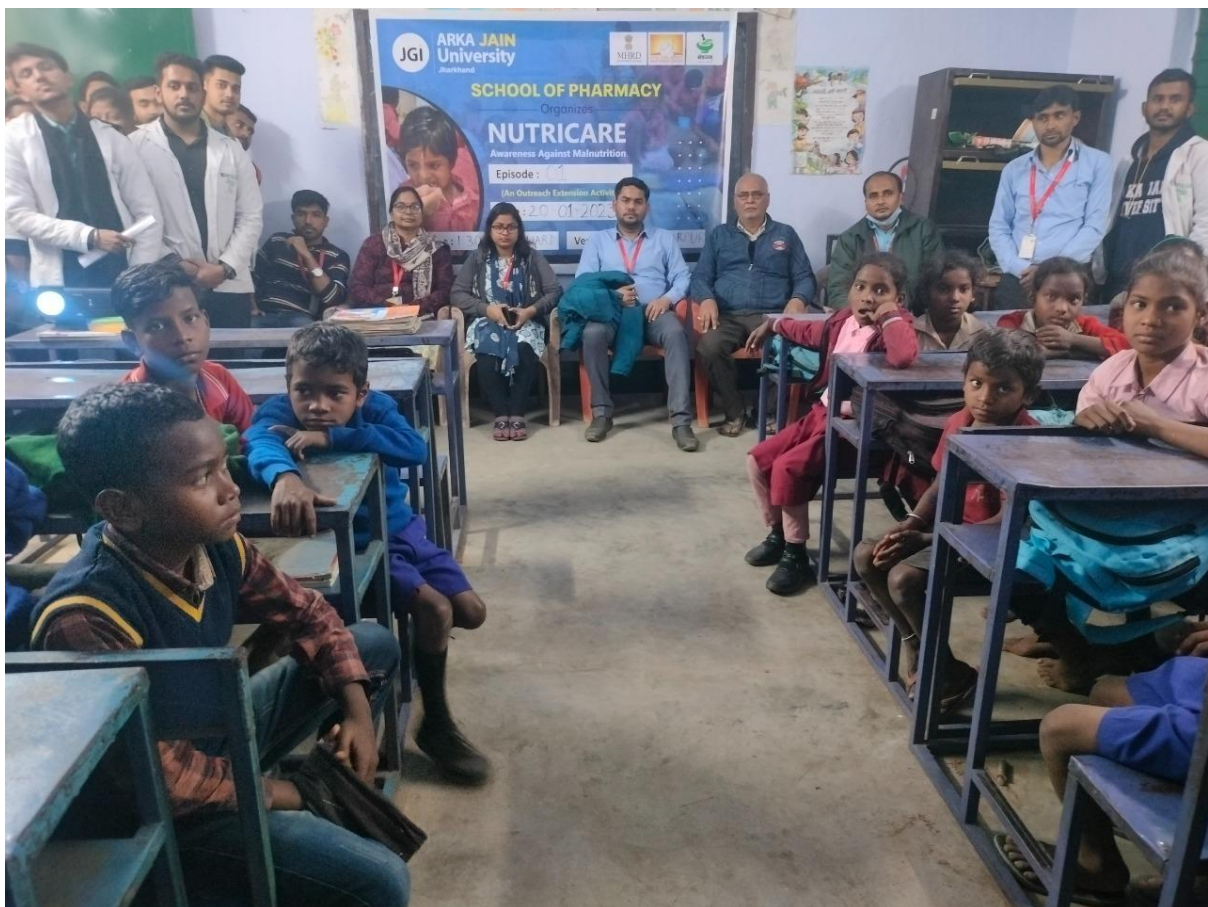
With Head Master of Harisundarpur Prathamik Vidyalaya