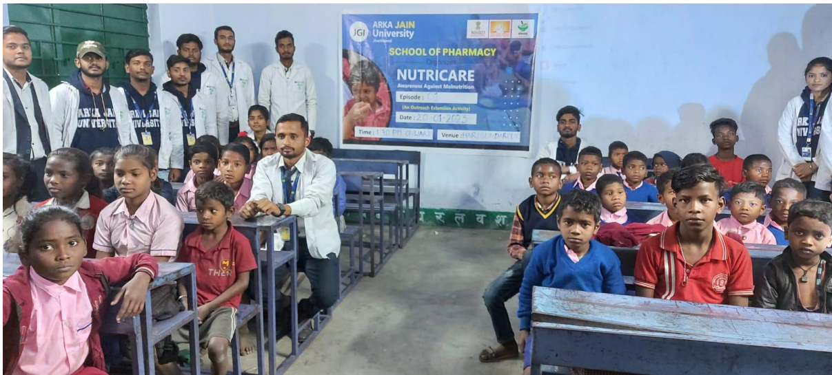
Great gathering ready for awareness against malnutrition