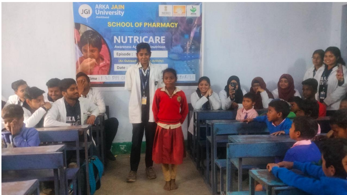
Make them smile with a small effort