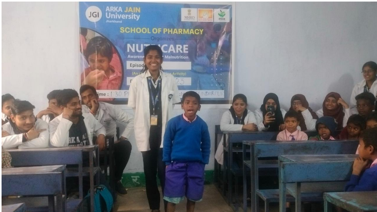
We are responsible for our community