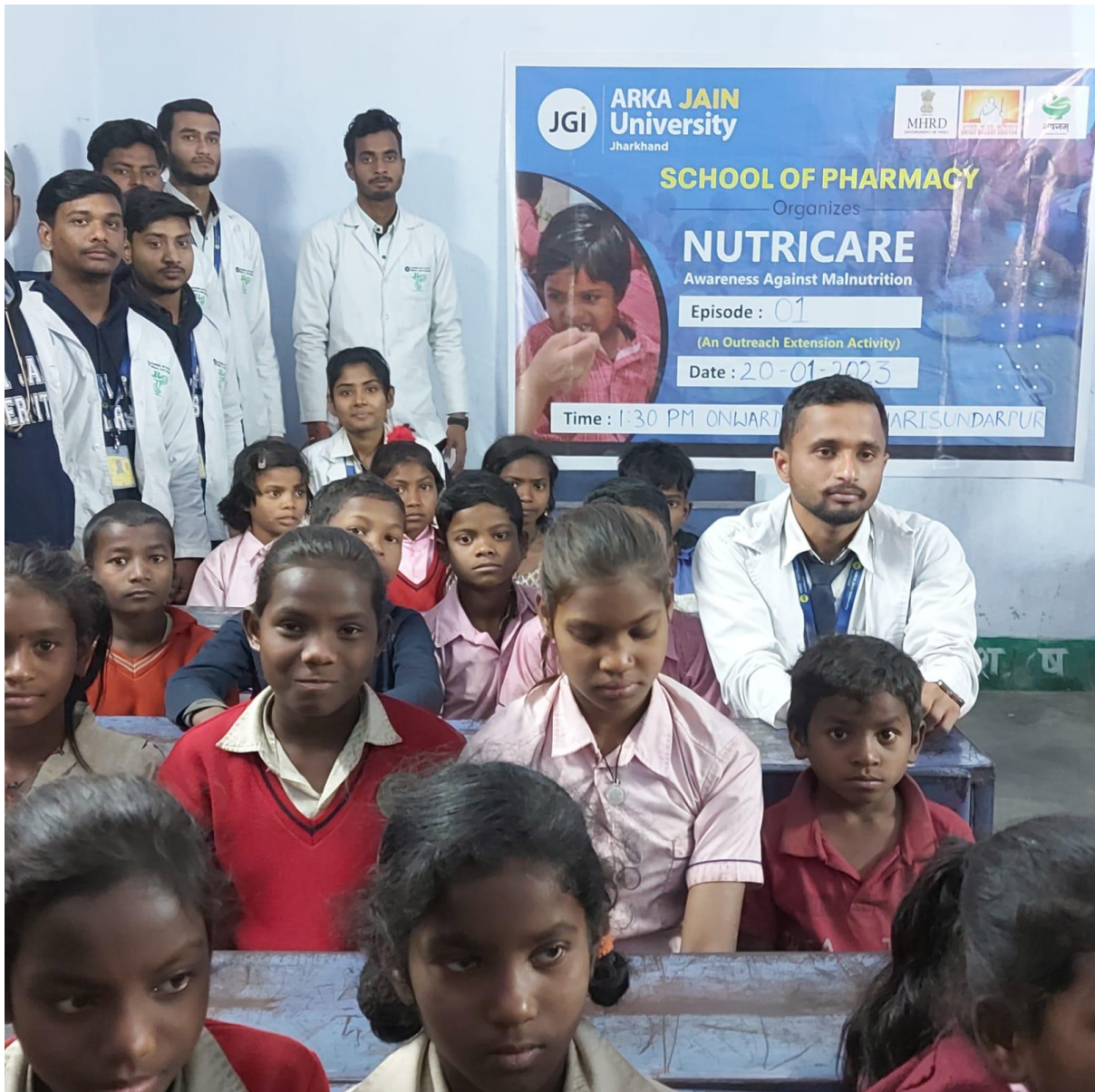
Attention to the event