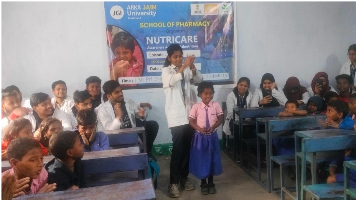
Fun with the students by the students