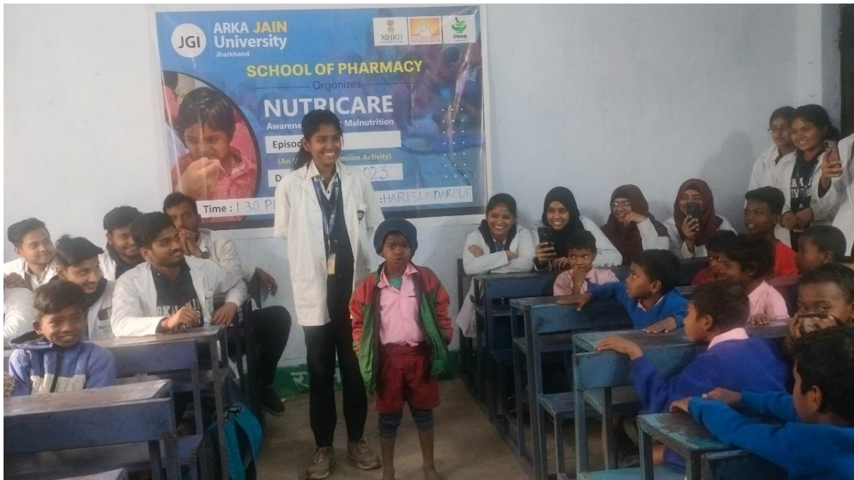
Smile needs just a reason