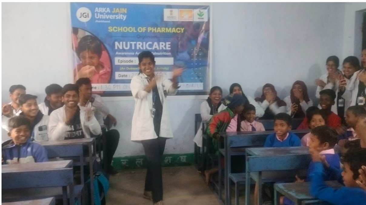
By heart stand with