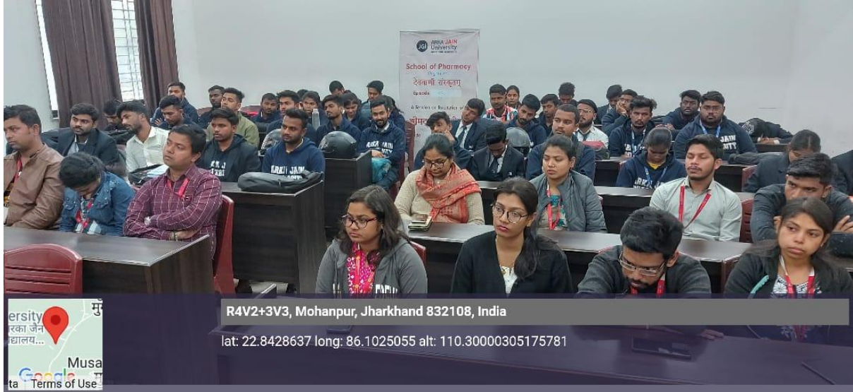
Audiences at Deva Vani Sanskritam Episode 2