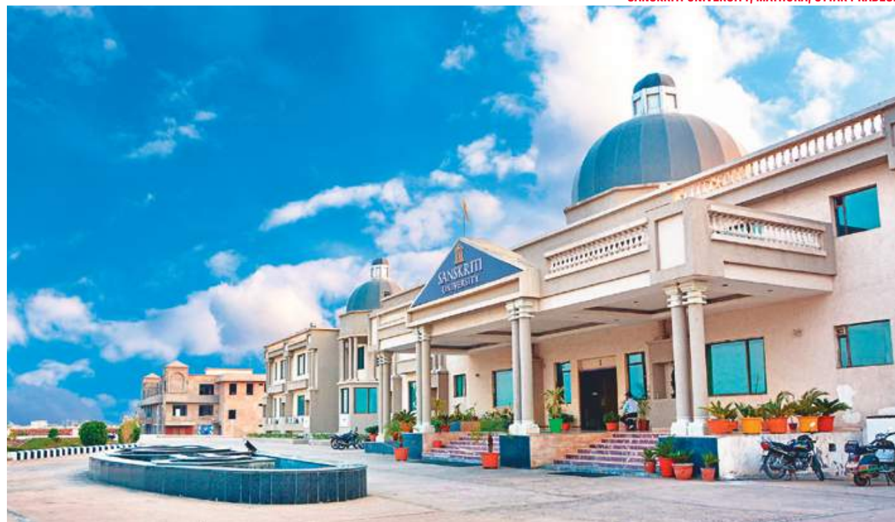
SANSKRITI UNIVERSITY, MATHURA, UTTAR PRADESH