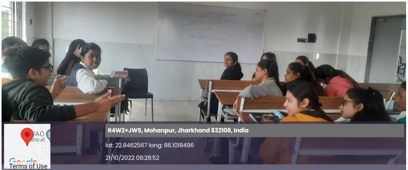
Sri Rabindranath Mahato, Hon'ble Speaker, Jharkhand Legislative Assembly addressing the students of 2 nd Students' Parliament