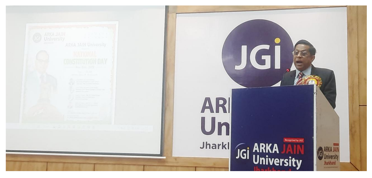
Hon'ble Vice-Chancellor addressing the gathering on Constitution Day