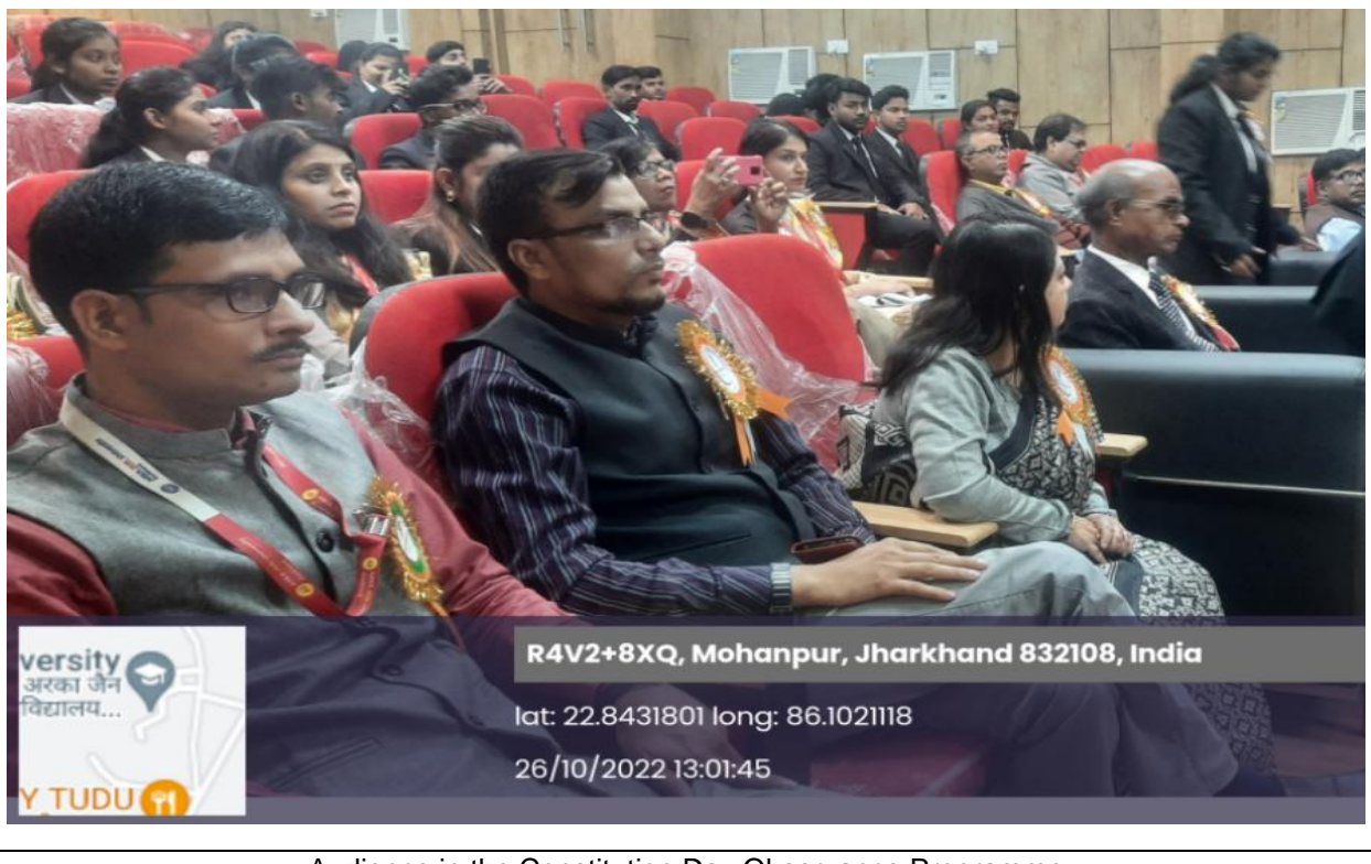
Audience in the Constitution Day Observance Programme