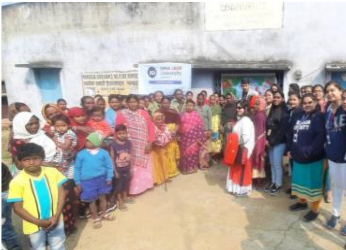
Fig. 1.2 P.P.T in Progress