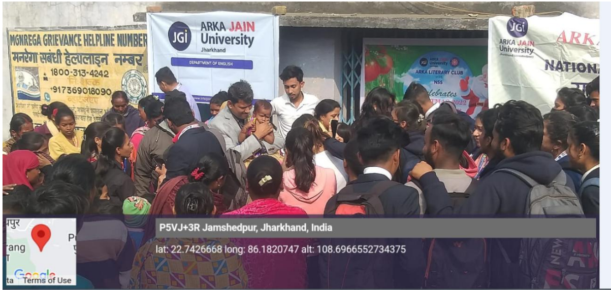
Fig. 1.1 P.P.T in Progress