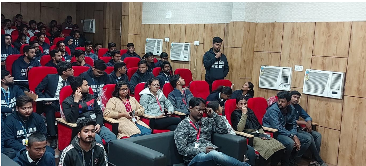
Student interacting virtually with Site Head Operations APL