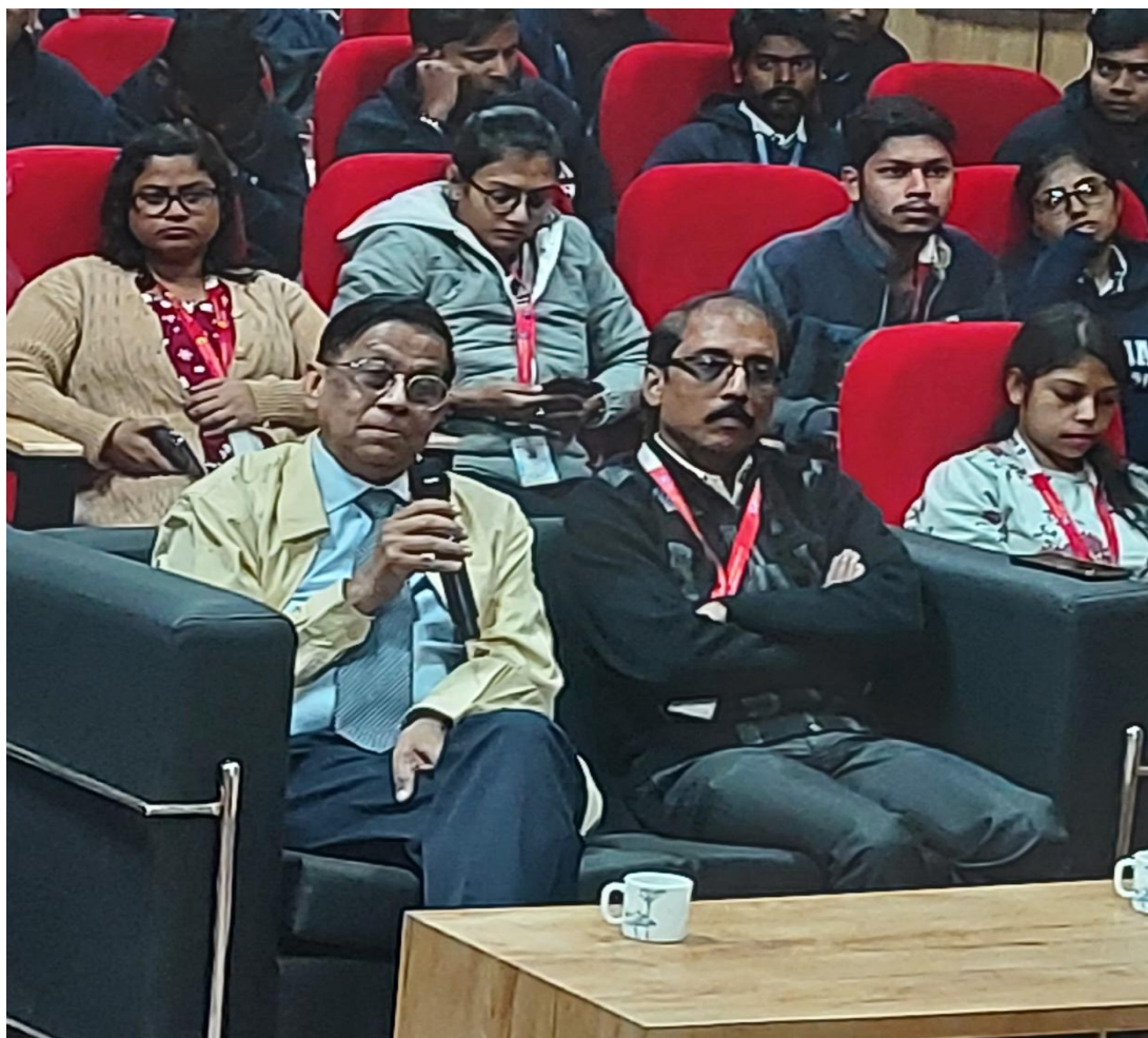
Questions of Cureosity