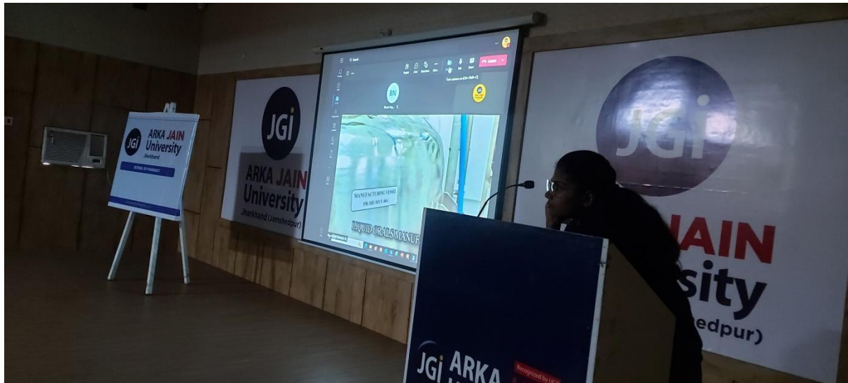
Virtual Visit to liquid Orals Manufacturing