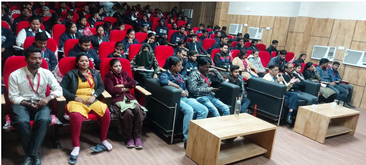
Honorable VC addressed