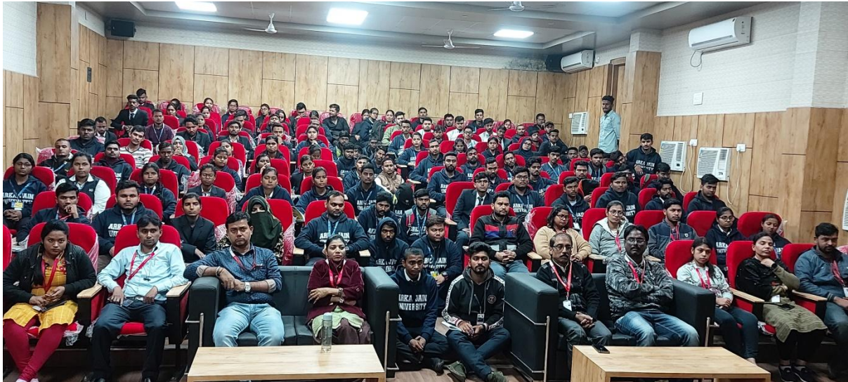
Houseful virtual industrial visit