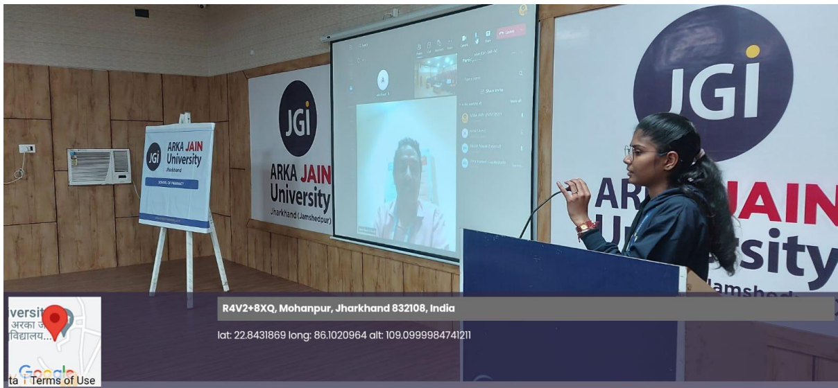
Virtual Visit moderated by SrishtiShreya