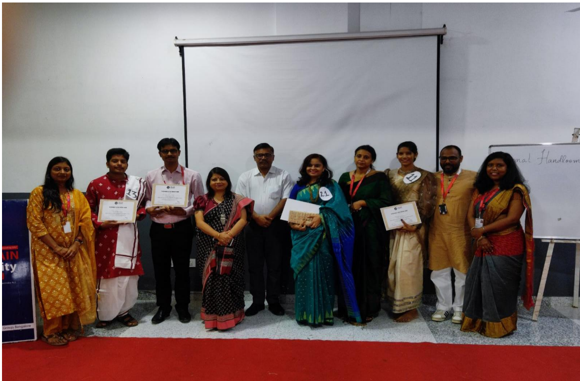
Figure 1.4 Photo of the Event Tana Bana