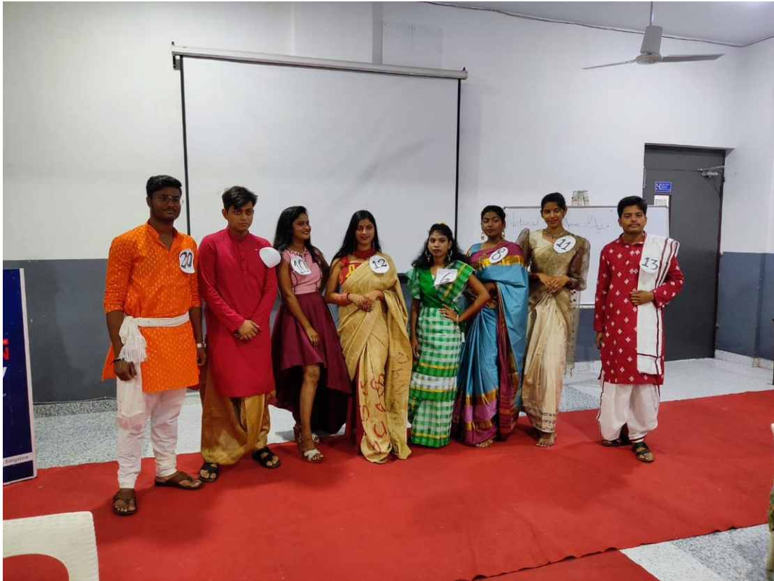
Figure 1.5 Photo of the Event Tana Bana