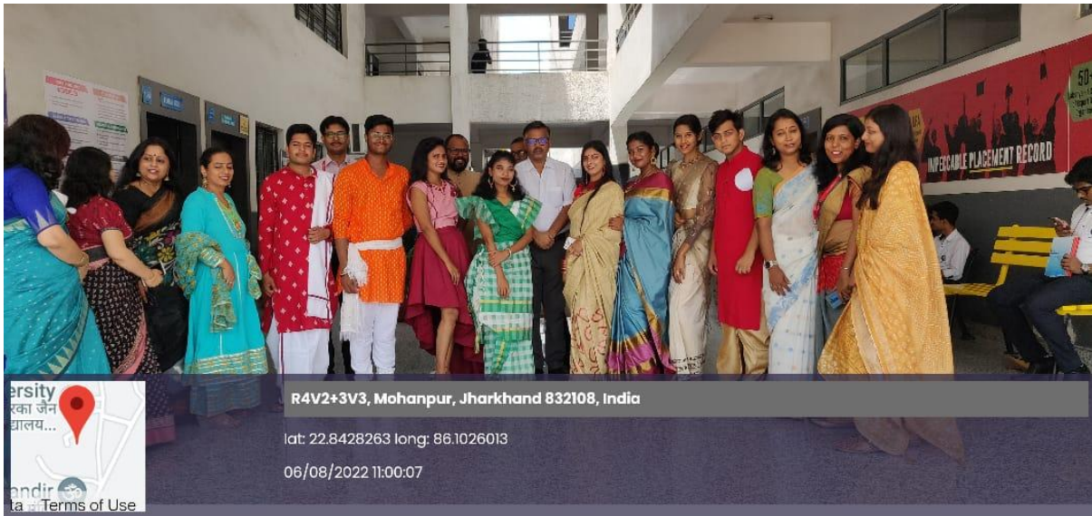
Figure 1.1 Photo of the Event Tana Bana