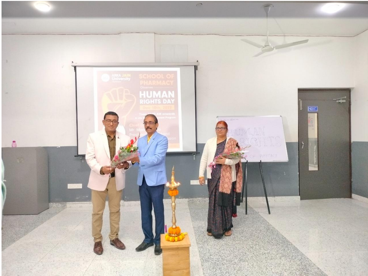
Welcoming with flower bouquet