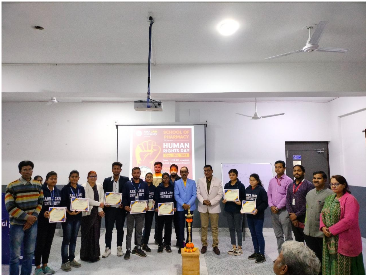
Students are awarded with Hero Hunger Award by Roti Bank Charitable Trust , Jamshedpur