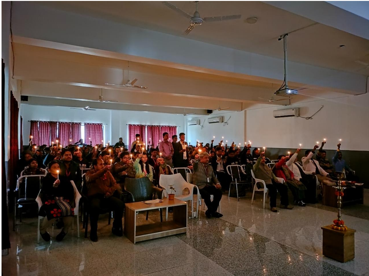
Moment witnessed with lighted candles by the participants spreading message Dignity, Freedom and Justice for All