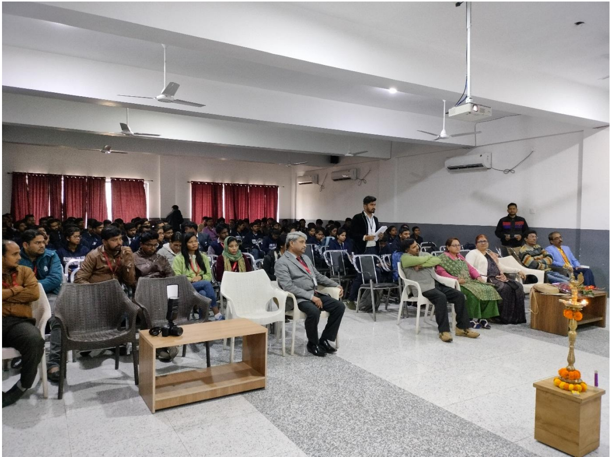
Student and faculty audience