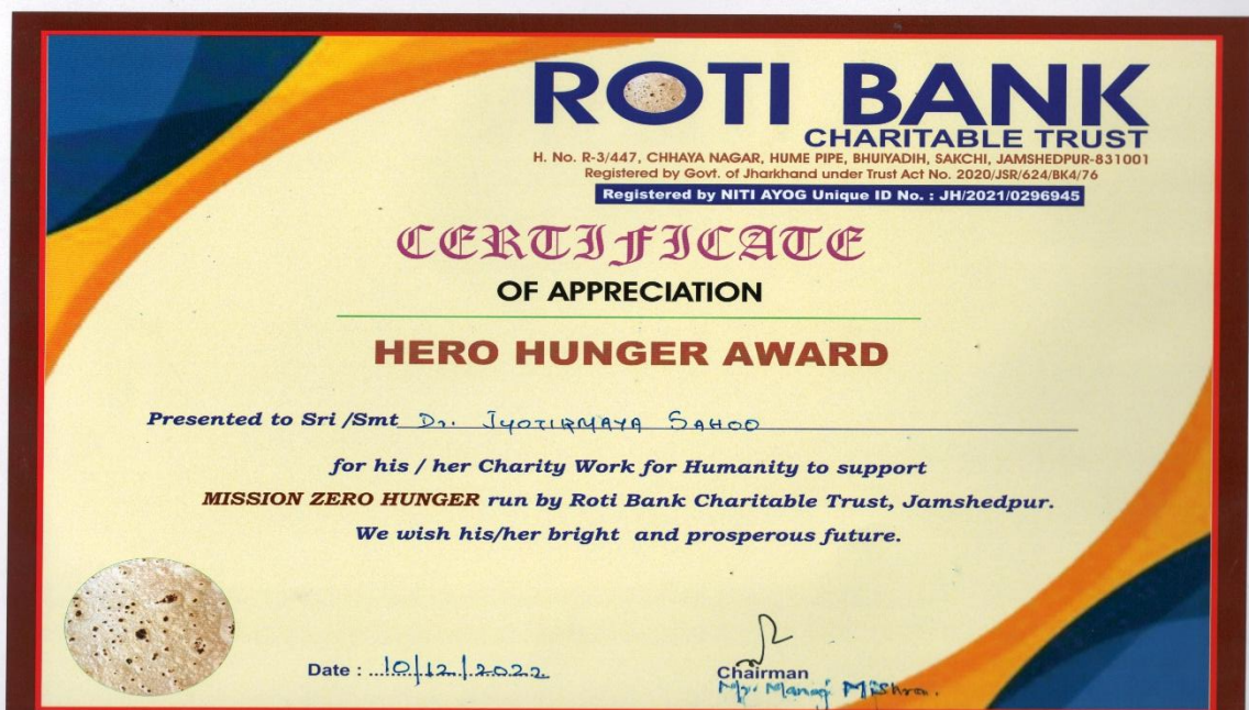
Certification by Roti Bank Charitable Trust