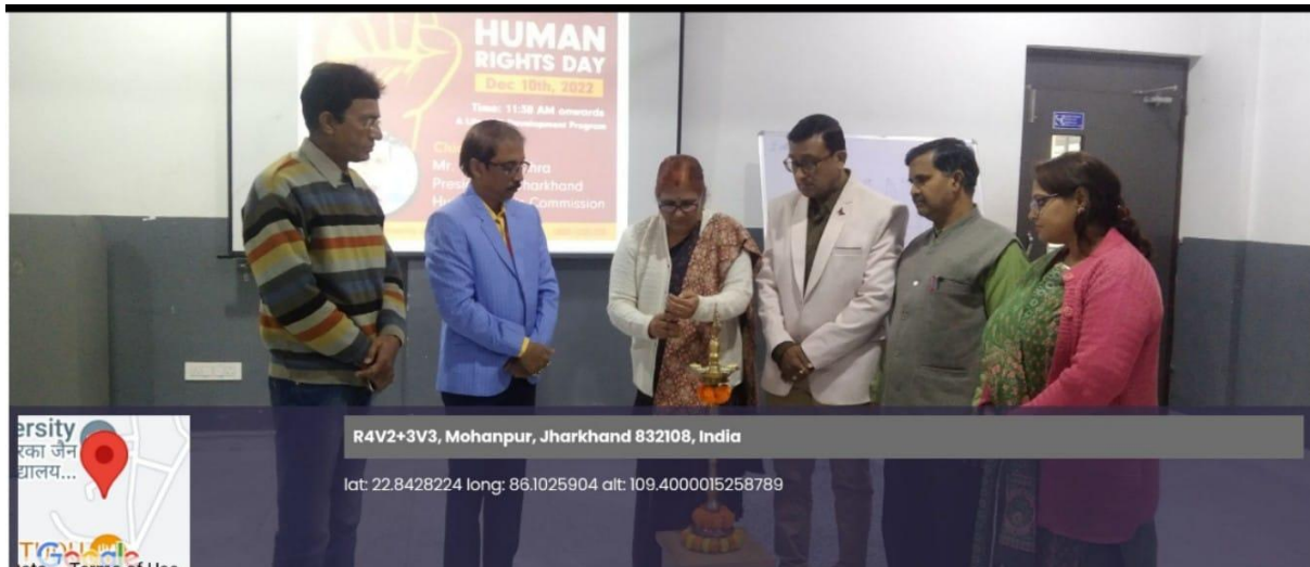
Inauguration of Event Human Rights Day 2022