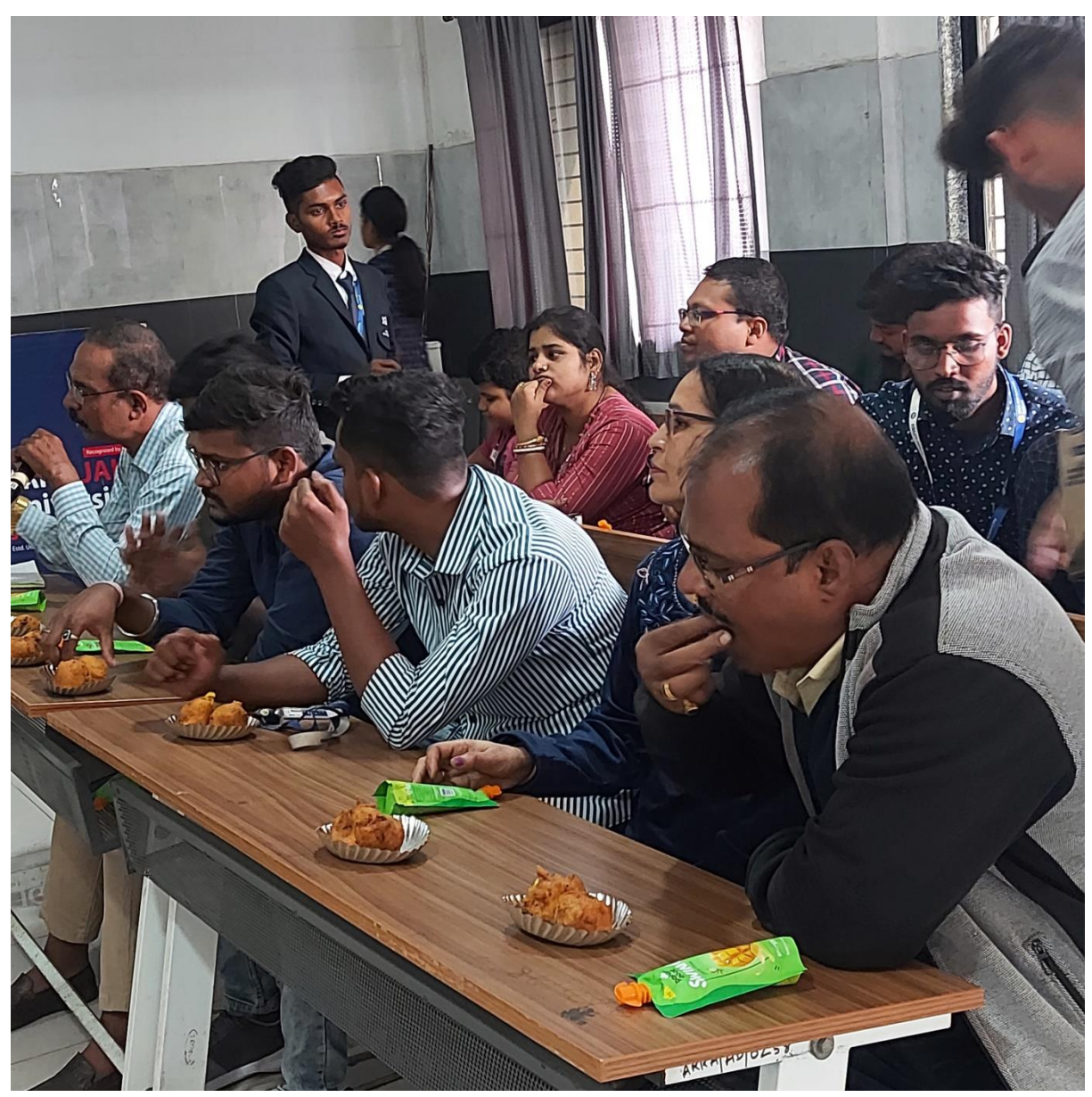
Small refreshment with the alumni