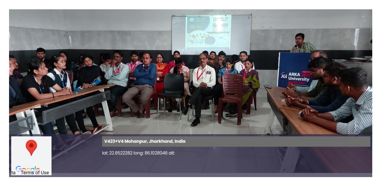
Participants in MILAP