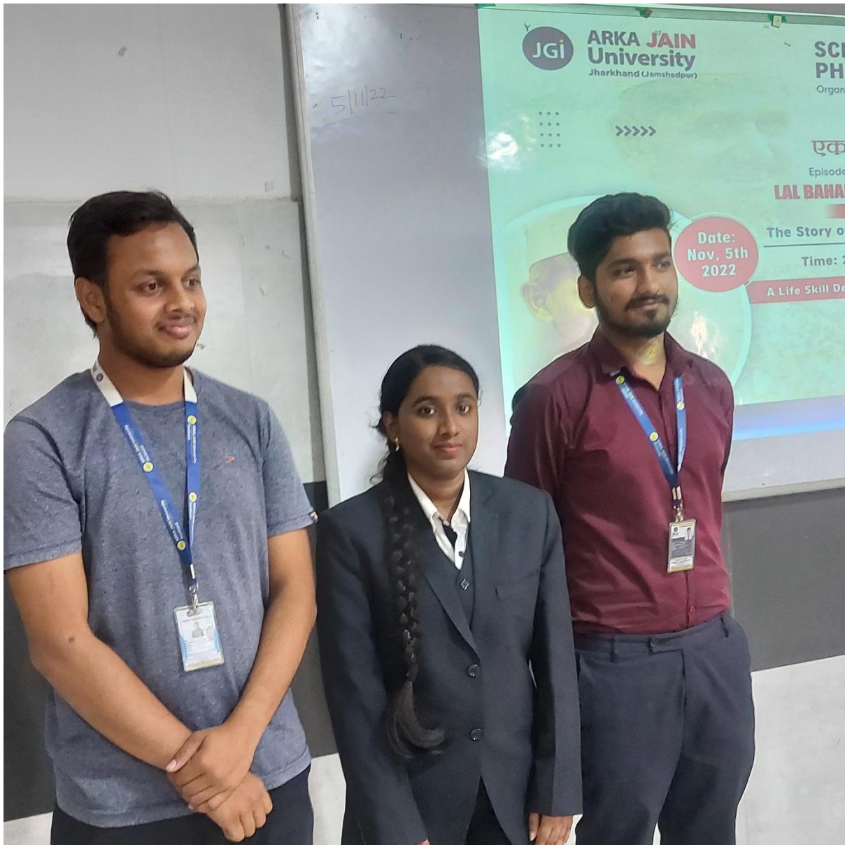
Winners of KrantiEk Veer Katha Stories Of Great Leaders Episode I