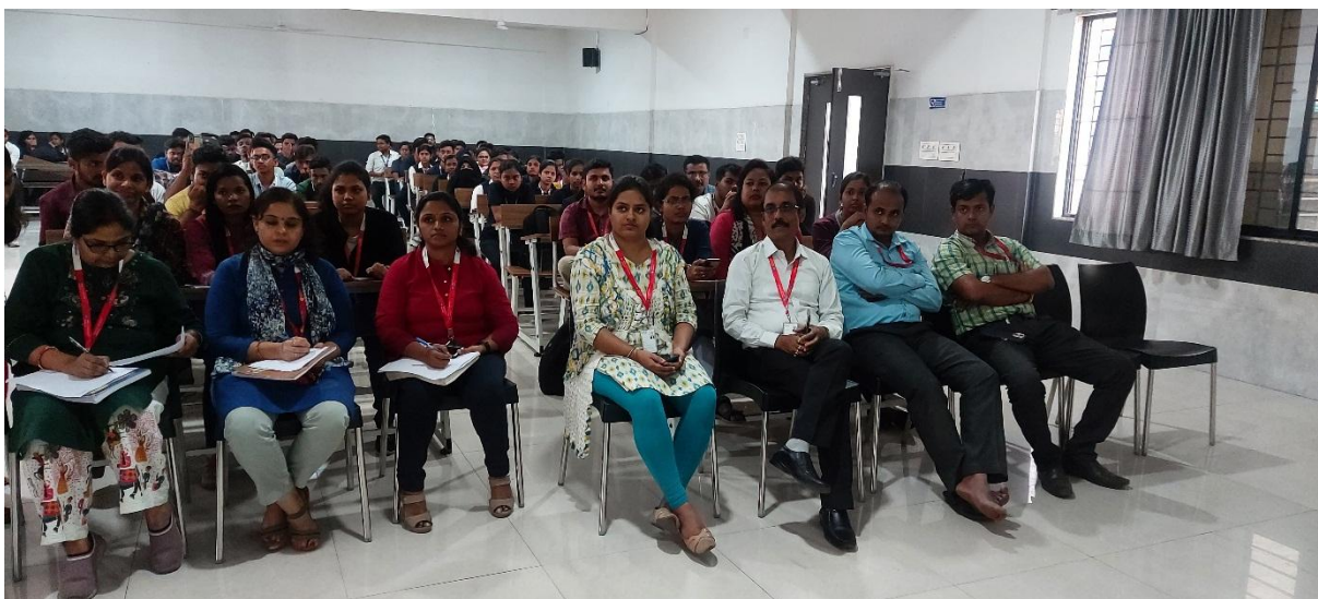
Audiences in KrantiEk Veer Katha Episode I