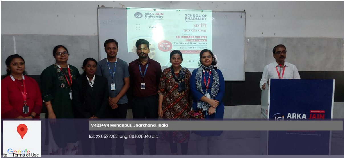
Winners along with judges of KrantiEk Veer Katha Episode I