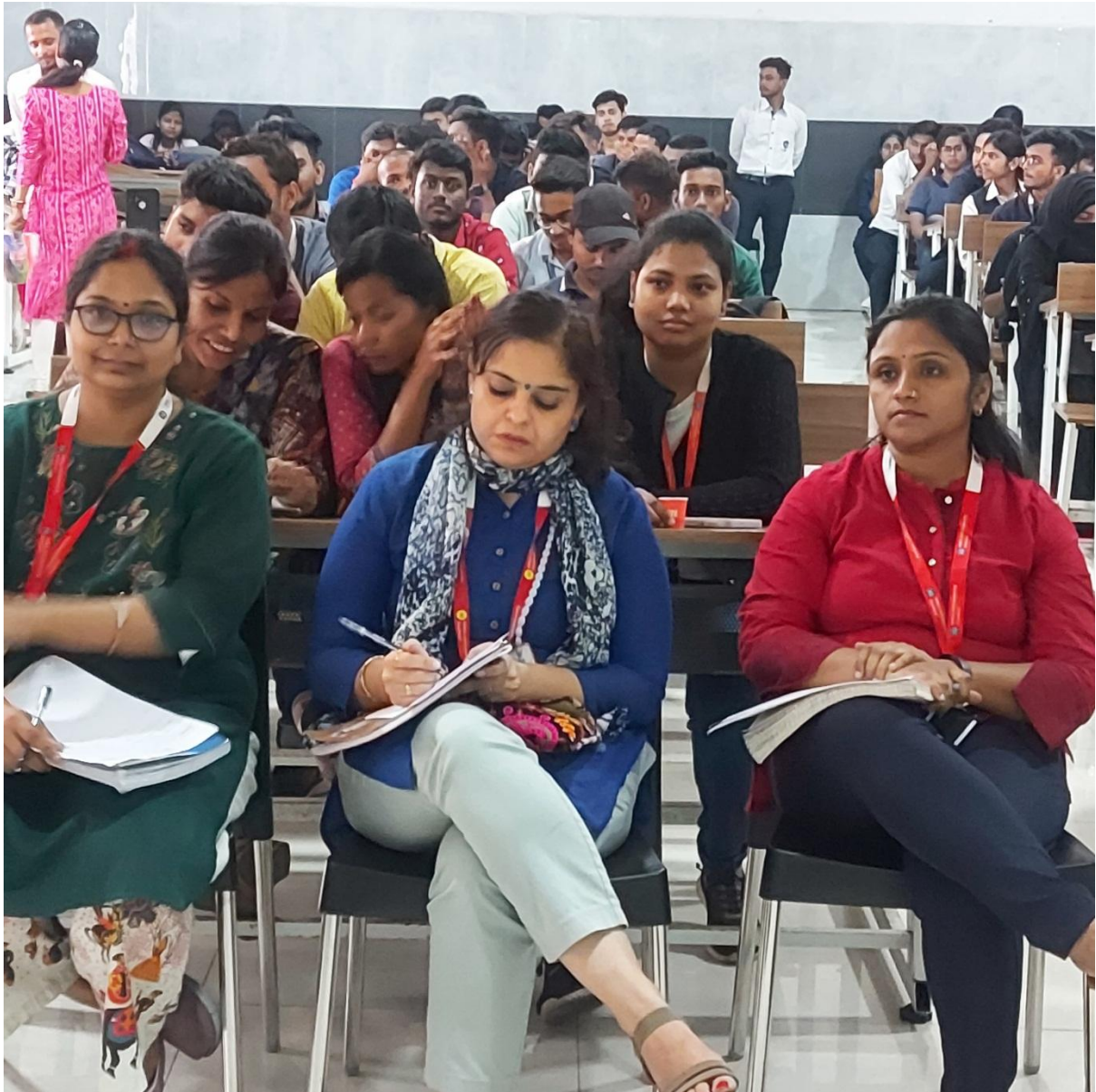
Judges Evaluating the performance