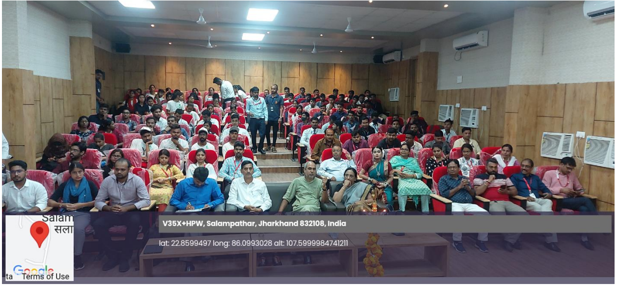
Audience full Auditorium