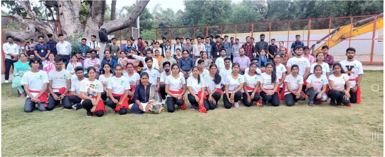
Ready for nukkad natakat जमीन स्वच्छ तभी होगी जब हमारी सोच स्वच्छ होगी।