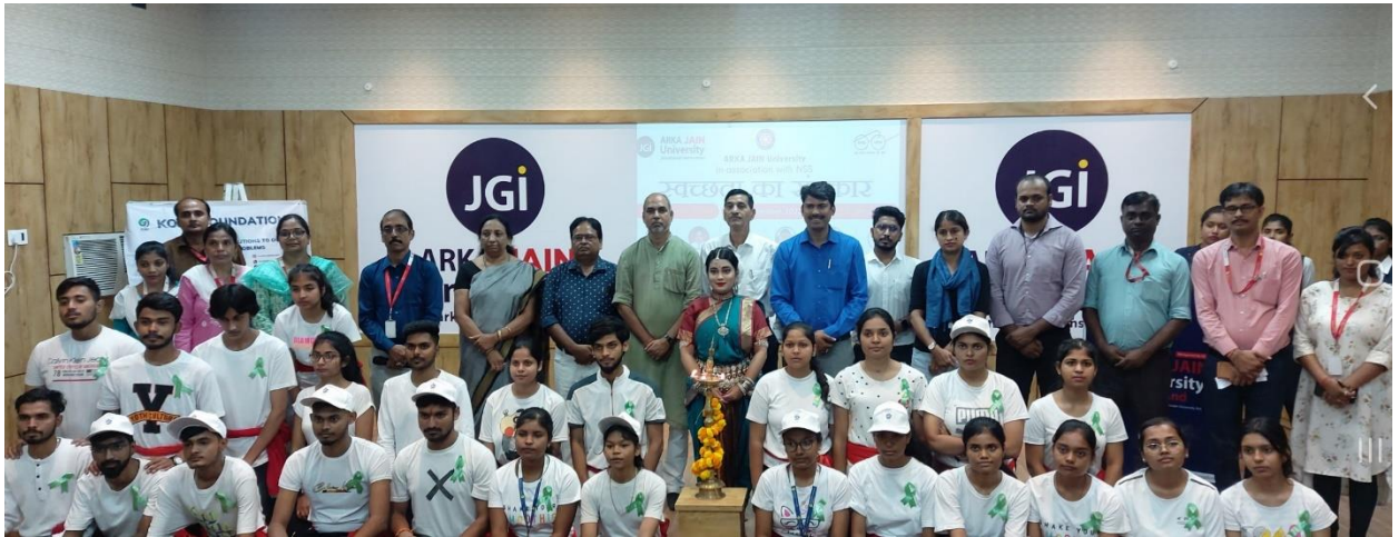
Volunteers and Dignitaries with the event “SWACHHATA KA SANSKAAR”