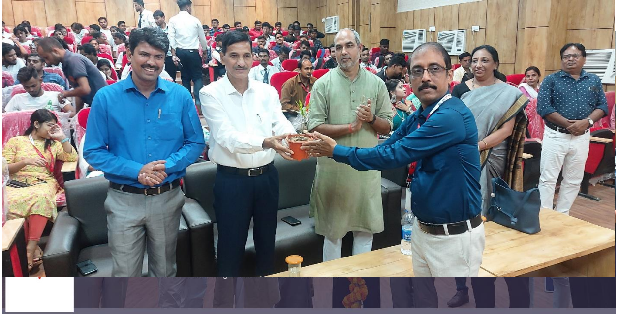
Witnessing the event with Chief Guest, Guest of Honor, Chief Speaker, Speakers and dignitaries