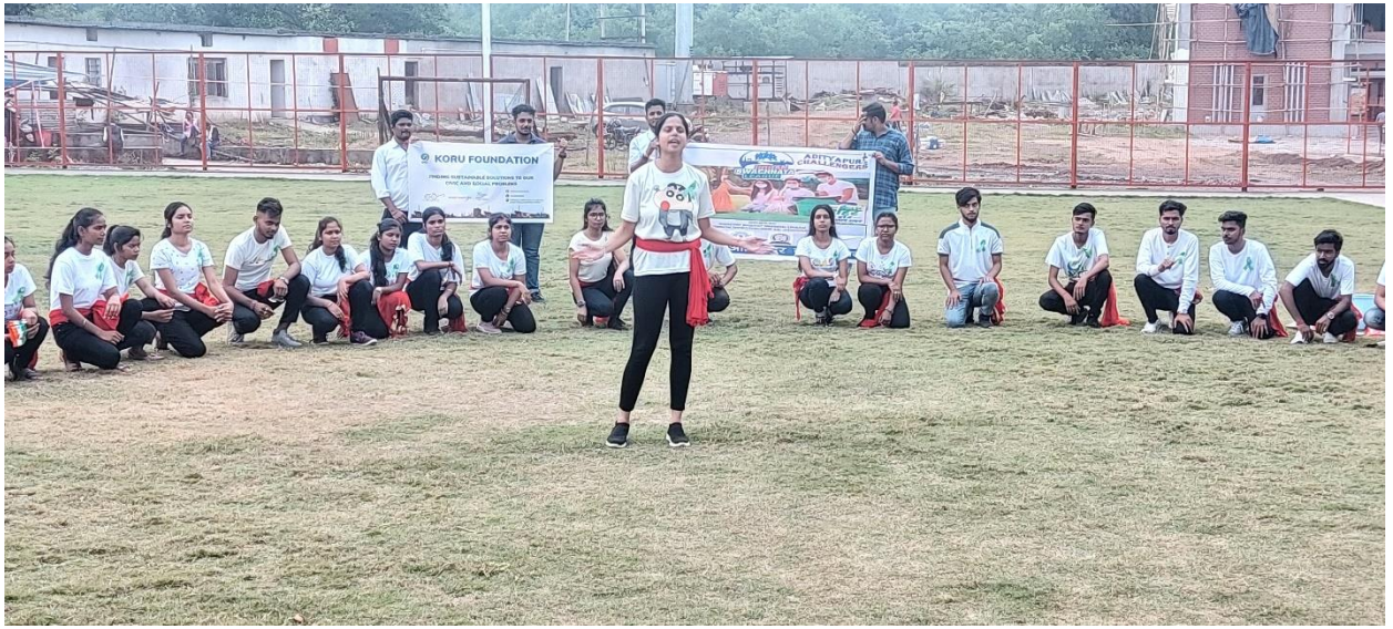
Glímpse of nukkád natak