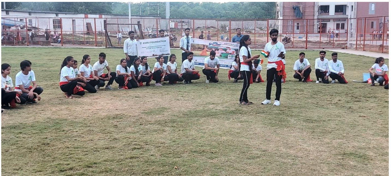
Glímpse of nukkád natak