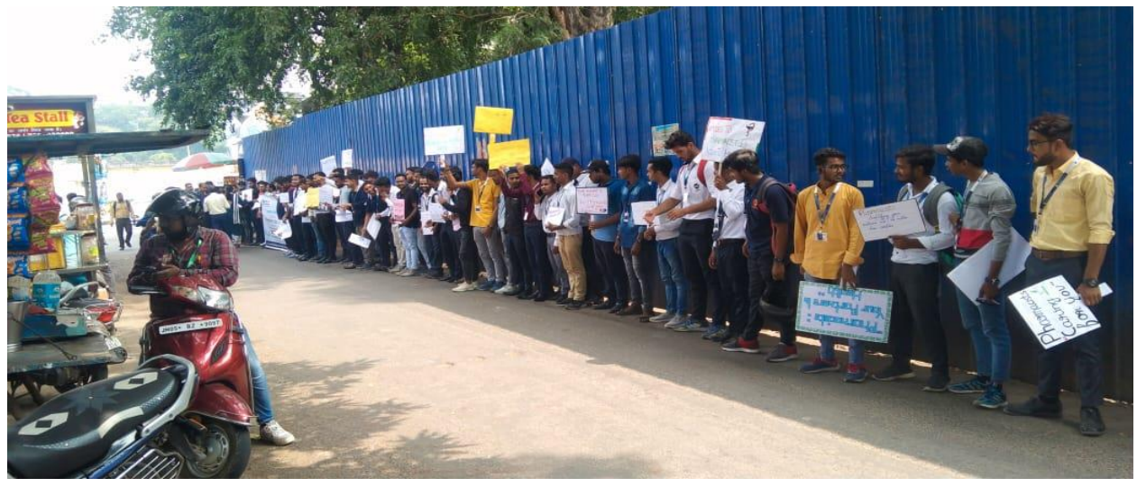
Rally with Discipline on the eve of Pharmacists Day