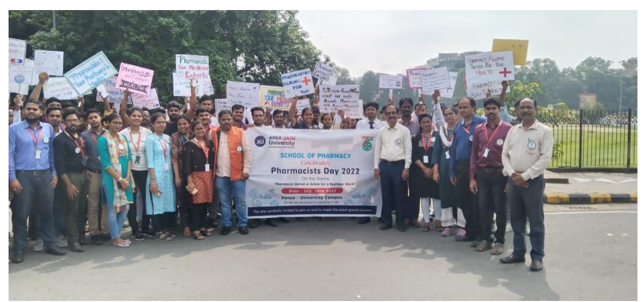
Students and faculties of Pharmacy with placards