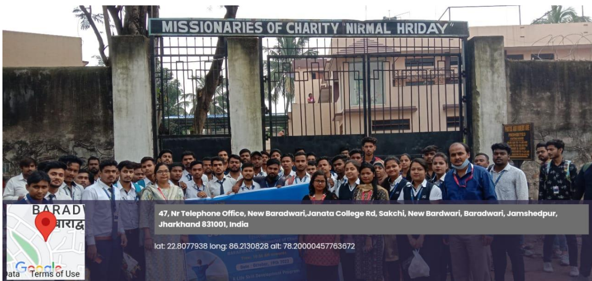
Students and faculties at the gate of NirmalHriday