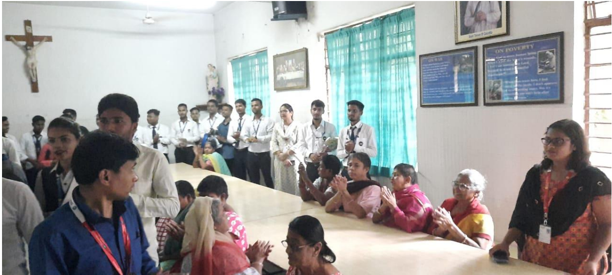
Students with the elderly persons engaged with singing together