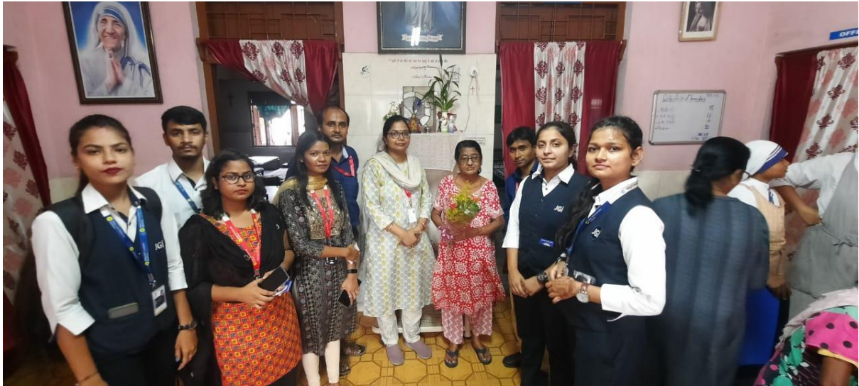
A moment with beloved sister (care incharge) and residential of Nirmal Hriday