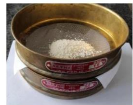
Wet and dry screening