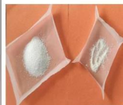
Weighing of excipients