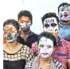
NAVOTSAV Gandhi Jayanti cum Navratri Celebration