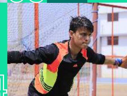
Club & Societies