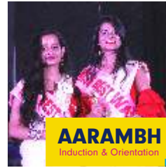
AARAMBH Induction & Orientation