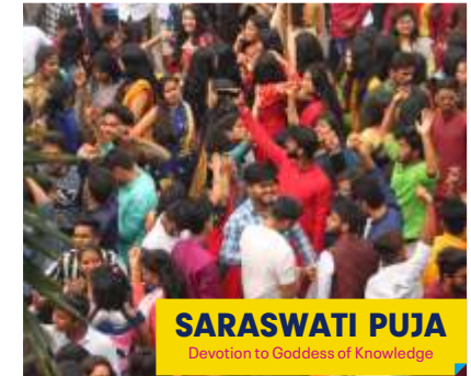
SARASWATI PUJA Devotion to Goddess of Knowledge