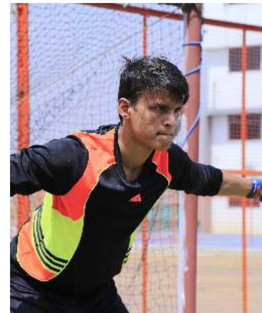
RUNBHOOMI Annual Sports Meet - Battle For Glory