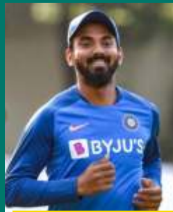
K. L. RAHUL