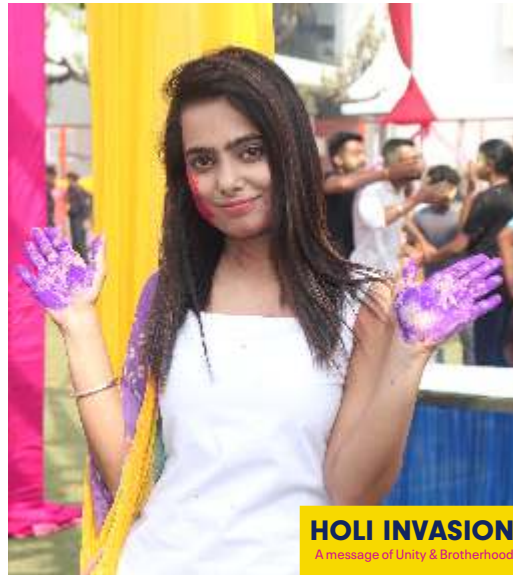
HOLI INVASION A message of Unity & Brotherhood