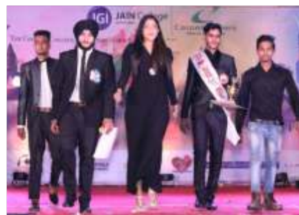
AAGAAZ An Annual Cultural Fest