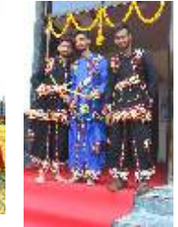
YUVA University Youth Festival