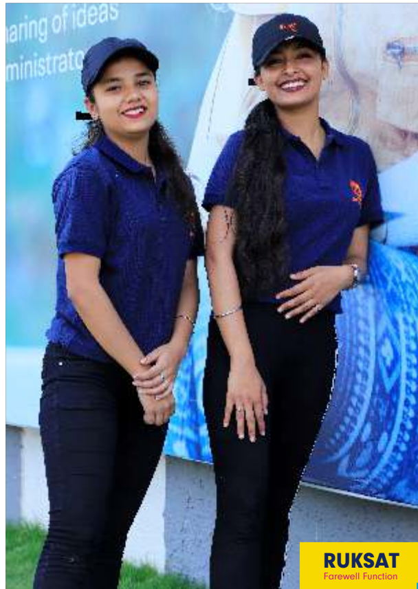
RUKSAT Farewell Function