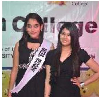
ROO-B-ROO Fresher's day - Ice Breaker For New Students