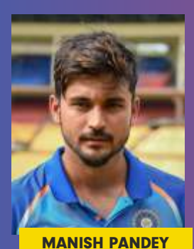
NATIONAL CRICKET PLAYER