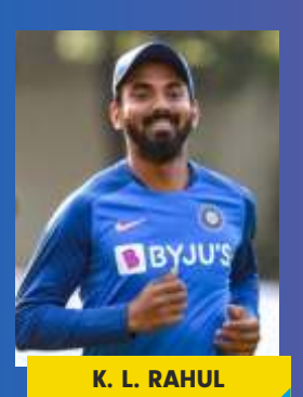
NATIONAL CRICKET PLAYER