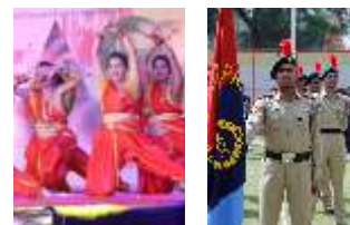
CARVAAN An Annual Expedition of AJU