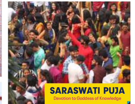
SARASWATI PUJA Devotion to Goddess of Knowledge