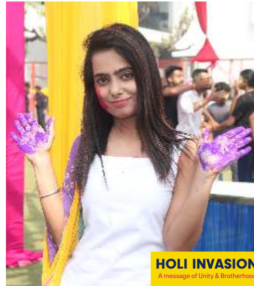
HOLI INVASION A message of Unity & Brotherhood