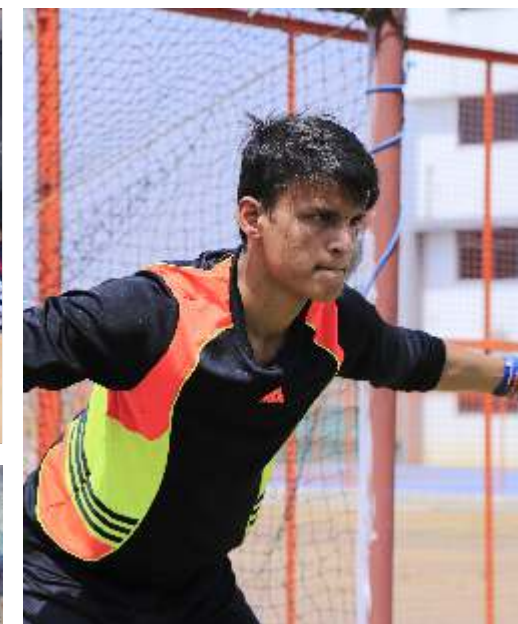
RUNBHOOMI Annual Sports Meet - Battle For Glory