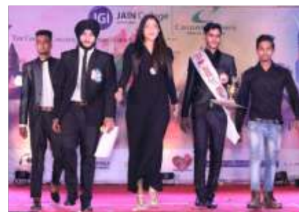
AAGAAZ An Annual Cultural Fest