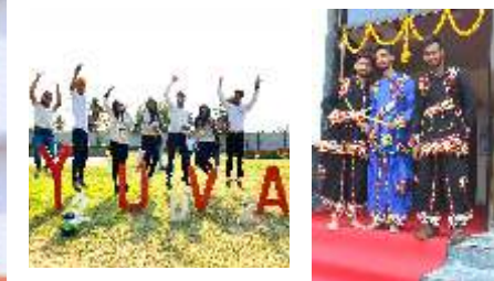
YUVA University Youth Festival