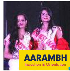
AARAMBH Induction & Orientation