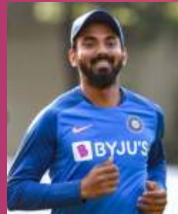
K. L. RAHUL