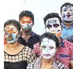
NAVOTSAV Gandhi Jayanti cum Navratri Celebration