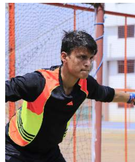
RUNBHOOMI Annual Sports Meet - Battle For Glory