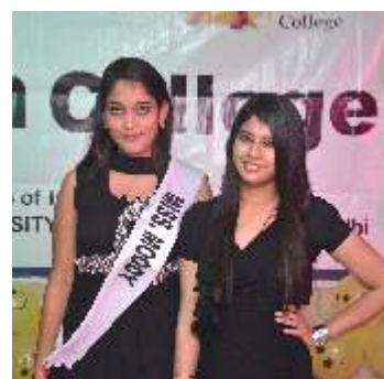
ROO-B-ROO Fresher's day - Ice Breaker For New Students