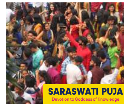
SARASWATI PUJA Devotion to Goddess of Knowledge