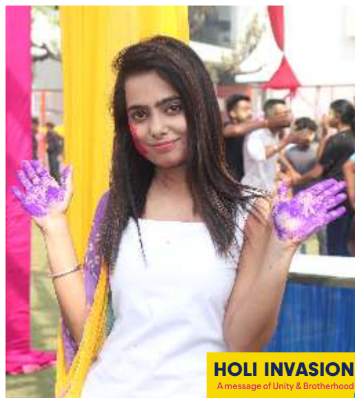
HOLI INVASION A message of Unity & Brotherhood