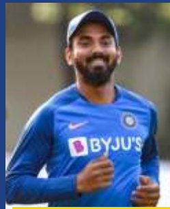
K. L. RAHUL