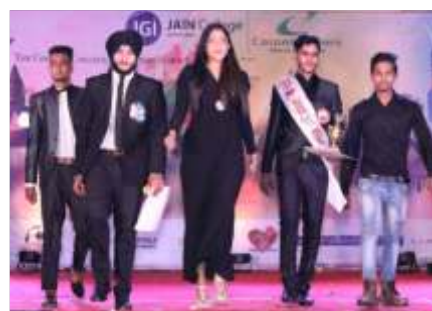
AAGAAZ An Annual Cultural Fest