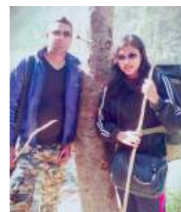
CARVAAN An Annual Expedition of AJU