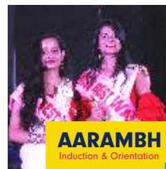
AARAMBH Induction & Orientation