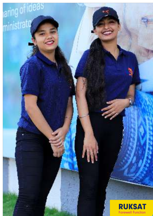
RUKSAT Farewell Function