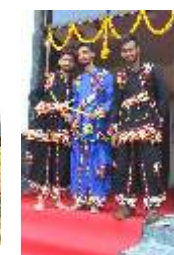
YUVA University Youth Festival