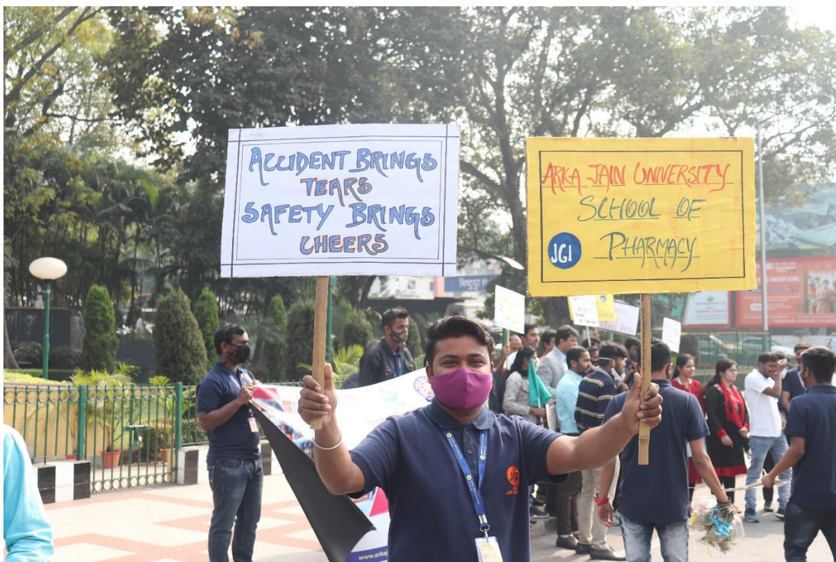
Awareness by the Students of B. Pharm 1 st year to the Public to obey Traffic Rules