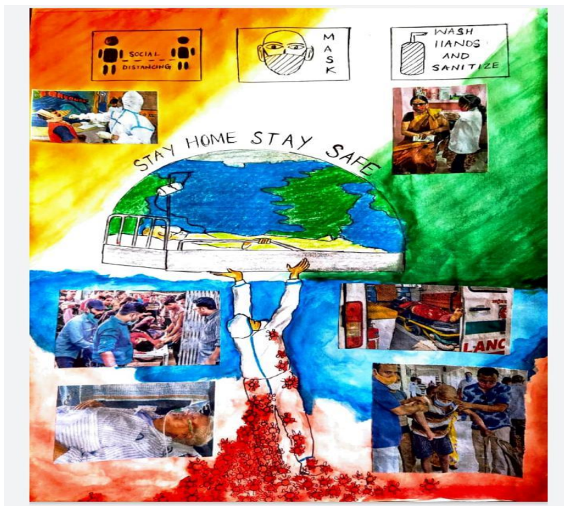
By A.M Shobhit (2 nd winner)